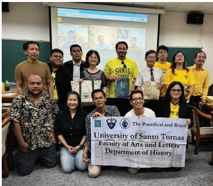
UST Department of History with the administrators, academic staff and students of Ph.D. in Asia Pacific Regional Studies of the College of Humanities and Social Science, National Dong Hwa University.