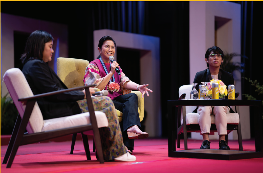
Human rights lawyer and Angat Buhay Chairperson Atty. Leni Robredo shares insights on synodality, education, social transformation, and sustainability, during the fireside chat.