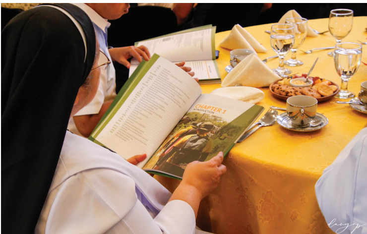
Participants read their copy of the handbook.