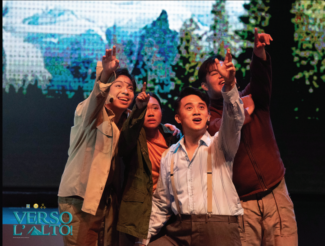
Frassati and his friends