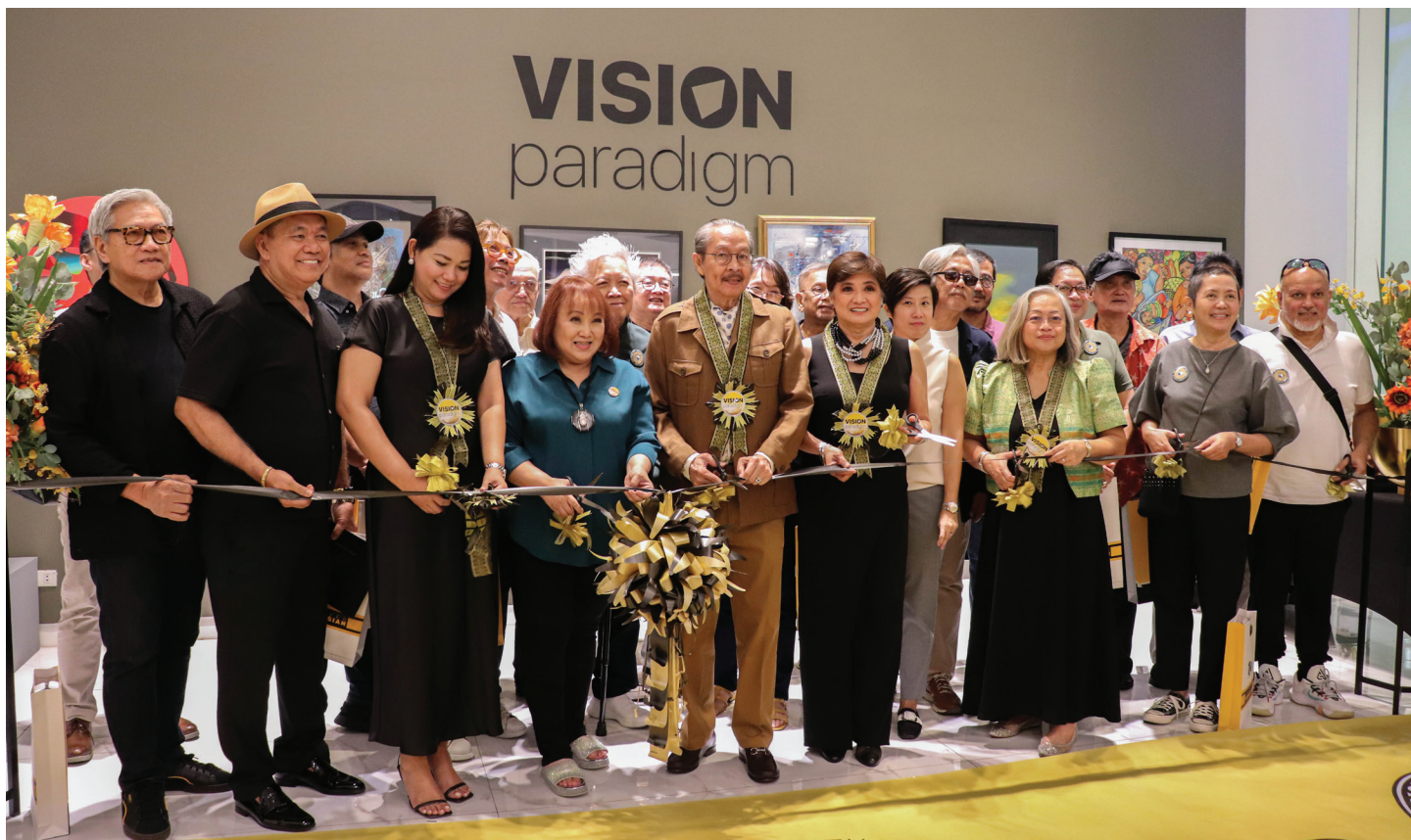
The organizers and Thomasian artists during the ribbon-cutting ceremony

The Office of Alumni Relations (OAR), in collaboration with UST Atelier Alumni Association, Inc. (USTAAAI) of the College of Fine Arts and Design, launched the all-Thomasian art exhibit called “Vision: Paradigm” on July 2, 2024 at the Art Lounge Manila in Molito, Ayala Alabang.