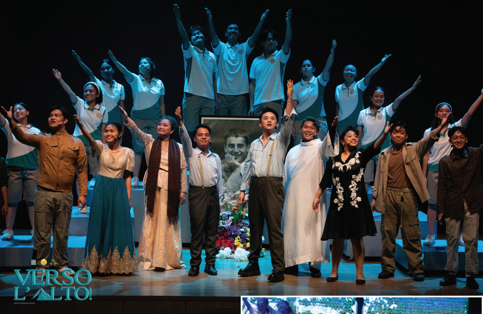
The cast of Verso L'Alto

T he UST Senior High School - Music, Arts, and Design (SHS MAD) track collaborated with the Cultural Center of the Philippines (CCP) to stage an original musical production about the SHS patron, Bl. Pier Giorgio Frassati, O.P. The play premiered on Bl. Frassati's feast day, July 4, at the Frassati Auditorium, and had additional shows on July 5 and 6, 2024.