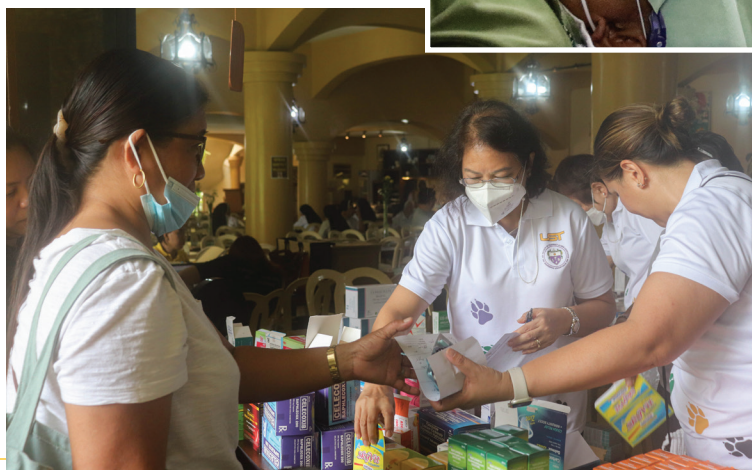
Volunteer pharmacists hand out medication