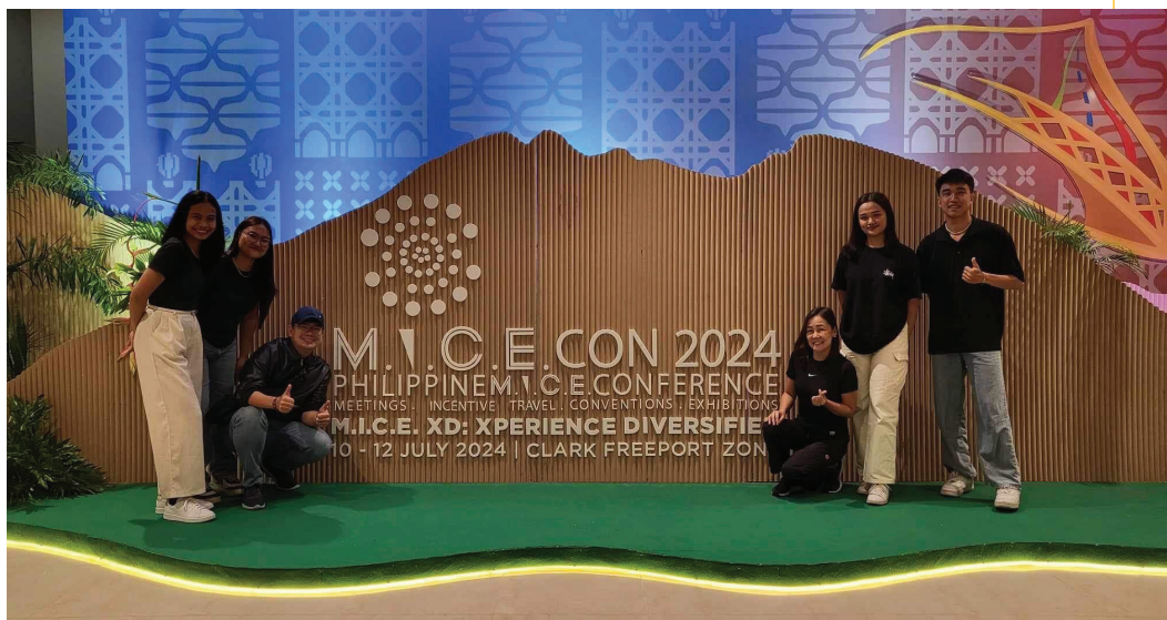
The UST Team