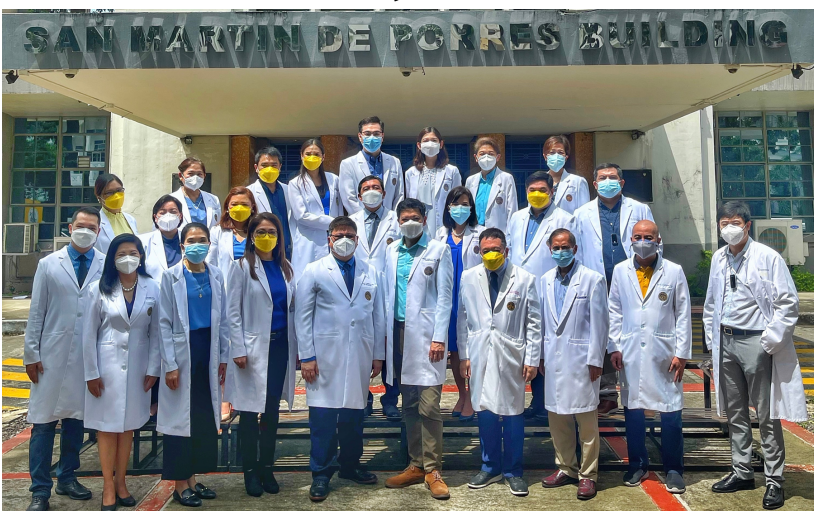
Department of Medicine Photoshoot for the Sesquicentennial Book of the USTFMS

Thus, everything being said, aside from documentation, the newsletter will be a testament of the Department's celebration of life involving all the faculty members that come and go in a certain time frame leaving an indelible mark for the future faculty members to see.