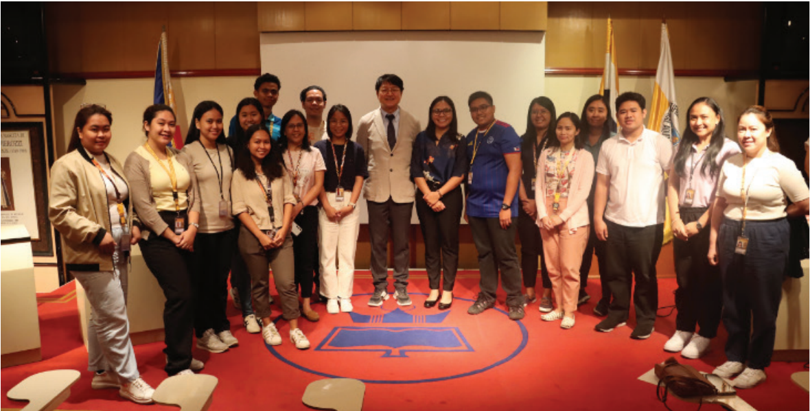
UST Food Science graduate students with the speakers