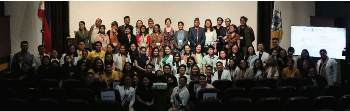
Participants of the GALACST 3rd International Conference