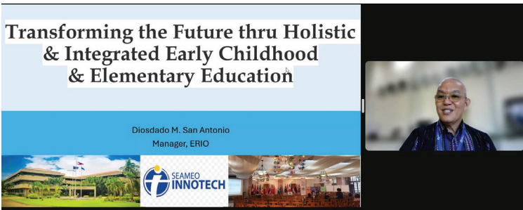
Dr. San Antonio's presentation