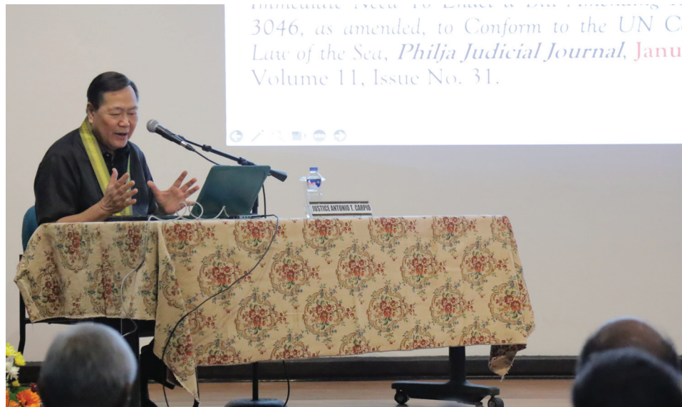
Justice Antonio T. Carpio delivers the 2024 St. Antoninus Lecture.

Also present during the event were UST Faculty of Arts and Letters Regent and