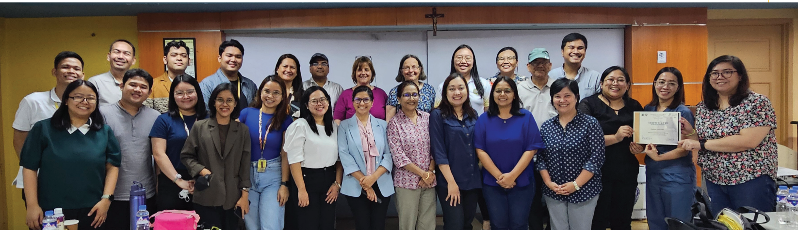
Facilitators and Participants at the UNESCO Chair Day