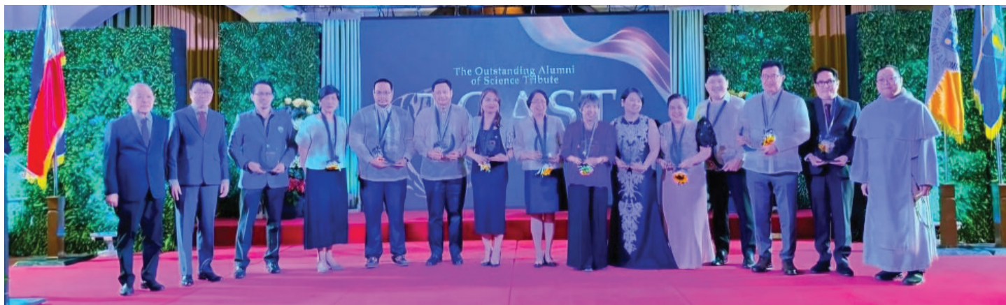
The Outstanding Alumni of Science Tribute (TOAST) winners for 2024

Open Science is supported by the United Nations, which called on governments to establish national and international policies on Open Science. The United Nations Educational, Scientific and Cultural Organization (UNESCO) also highlighted the importance of Open Science principles for the benefit of humankind and planetary sustainability in its 2021 "Recommendations for Open Science". In the United States, federal agencies declared 2023 as a Year of Open Science and organized various events, which espoused the integration of open science initiatives into their policies. ■