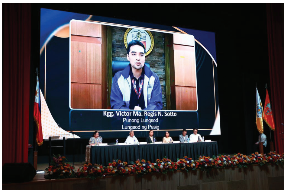
Pasig Mayor Hon. Vico Sotto congratulates the teachers.