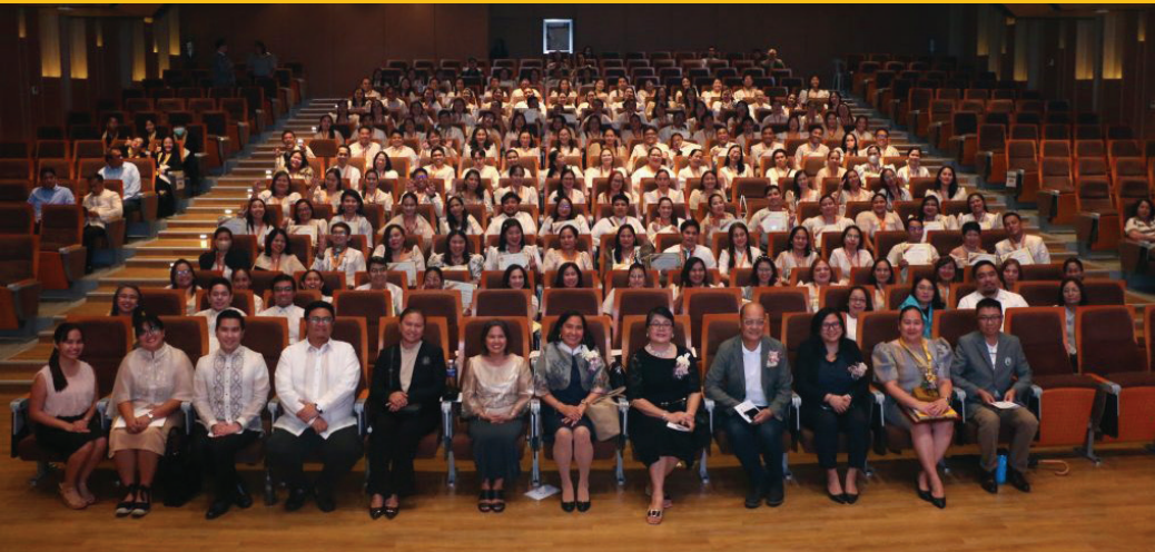
The teachers at the completion ceremony

A total of 158 teacher-scholars from the Department of Education (DepEd) in Pasig City have completed the Certificate in Science Teaching (CST) Program offered by the UST College of Education.