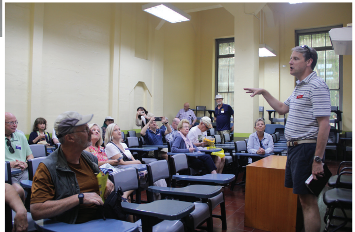
The guests briefly visit a classroom in the Main Building, which used to serve as a dormitory for the internees.

UST History Department Chair Dr. Archie Resos delivered a lecture on the Santo Tomas Internment Camp for guests from the National World War II Museum in New Orleans, USA, some of whom are relatives of previous internees. The lecture was held on March 20, 2024 at the St. Raymund de Peñafort Building.