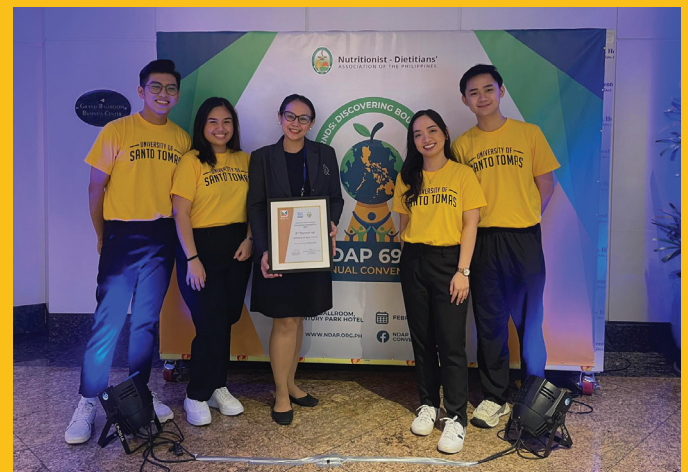
The UST Team