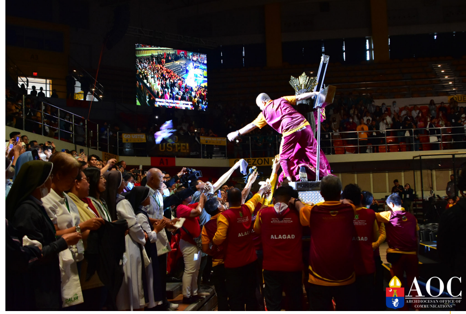
Participants join the Traslacion of the Nazareno.