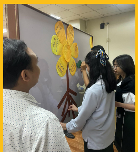
Workshop participants respond through the flower tool

The global dissemination webinar, which served as a culmination of the workshops, also marked the 2023 International Volunteering Day celebration.