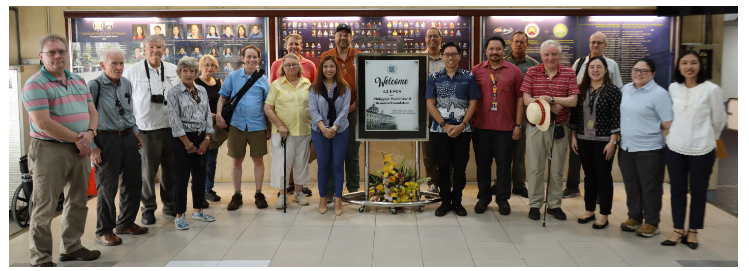
Faculty of Arts and Letters officials and the Office of Public Affairs team with the foreign guests.