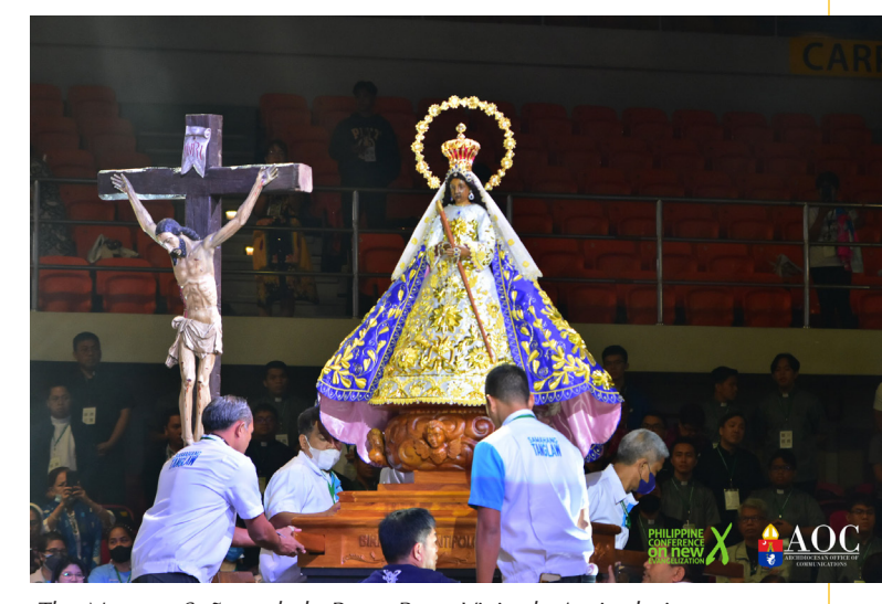
The Nuestra Señora de la Paz y Buen Viaje de Antipolo is enthroned.