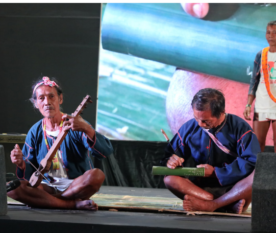
Mangyan tribe during their tribal performance