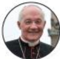
His Eminence Marc Cardinal Ouellet