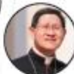
His Eminence Luis Antonio Cardinal G. Tagle