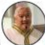
Most. Rev. Socrates B. Villegas, DD