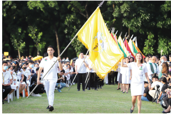
Representative students from each of the degree-granting academic units bring their college flags to the Grandstand.