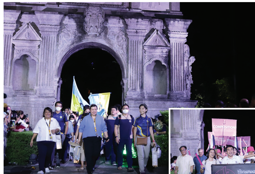
Students exit the Arch of the Centuries to signify the completion of their Thomasian life within the four walls of the campus.

The program ended with the highly anticipated pyromusical presentation. ■