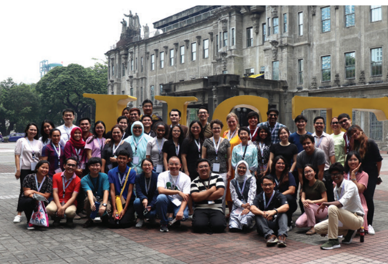
The instructors and participants of the Bacteriophage Workshop in Southeast Asia

Apart from capacity building and teaching phage biology to scientists in South East Asia, the PGH and the UST BEATS Research group aimed to create a consortium of phage biologists in the region through this workshop to further phage research and to exchange knowledge between institutions from the different countries in Southeast Asia. They are also looking into antibacterial phage technology as an alternative to antibiotics since antimicrobial resistance is one of the major concerns in the region. ■