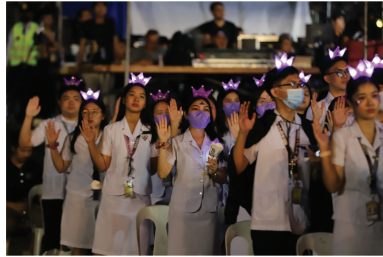
Graduating students from the Faculty of Pharmacy recite the Thomasian Pledge of Loyalty.

exhausted, we found light and still pushed forward. We became competent . In clinging to our hopes and dreams, we became committed , but we must not forget those who were left behind. In a world where not everyone can enjoy the same things we do, achieve the same goals, and be with us in moments of triumph such as this, we must see this occasion not just as a time of rejoicing, but as a reminder of our mission. When we cross that Arch and exit the gates beyond the four corners of the University, let us devote ourselves not just to prosperity, but to service.”