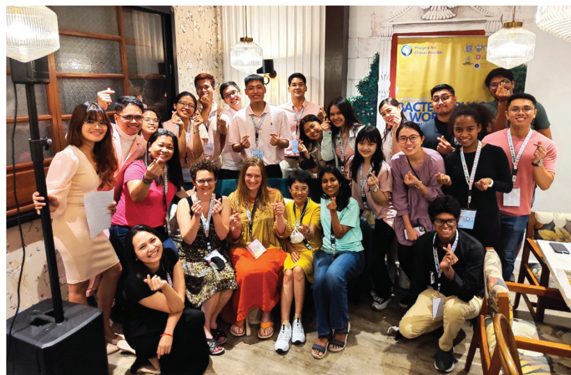
The workshop instructors with the UST BEATS Research group, the pioneering group of Phage researchers in the Philippines as the steering and working committee of the Bacteriophage Workshop