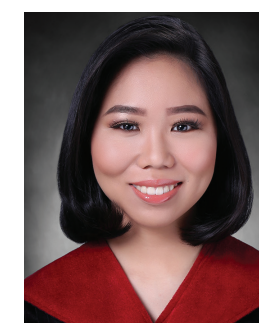
1st - 84.50% Bhing-Bhing Panagsagan Ko

UST Passing Rate: 57.03% National Passing Rate: 81.38%