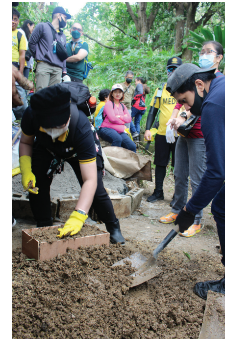
Participants during the earth house demonstration

The midyear activity was a follow-through on the Community Service Day: Tree Planting and Growing Activity held on October 22, 2022. The participants included various internal stakeholders from different academic and administrative offices. ■