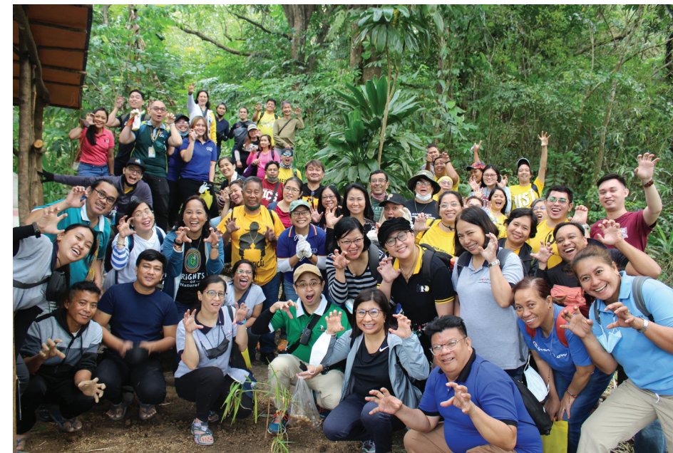
Organizers, participants, and FCCAI staff

various product demonstrations started, an opening ritual was held to symbolize the vital role of the earth, water, wind, and fire in the balance of our ecosystem.