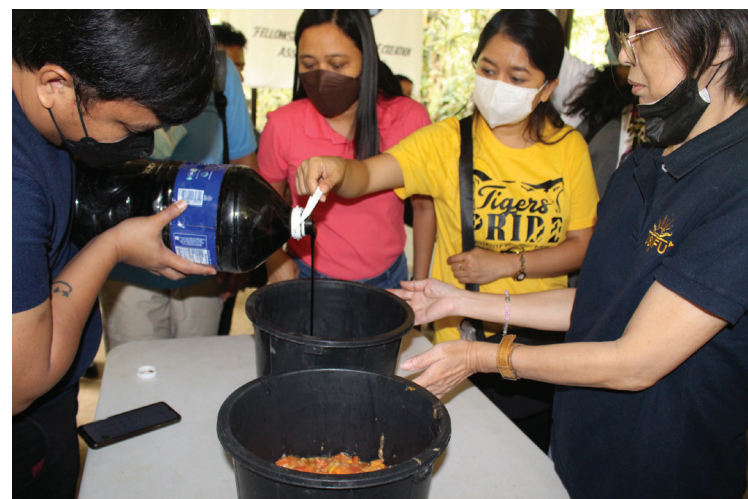
FCCAI staff with the participants as they put molasses in the mixture of organic fertilizer

The UST Simbahayan Community Development Office, in collaboration with the Office of the Vice-Rector for Religious Affairs, Human Resource Department, UST Alumni Association Inc., Thomasian Employees' Credit Cooperative, and Fellowship for the Care of Creation Association, Inc. (FCCAI) held the Midyear Community Service Day on January 28, 2023, the feast day of the University's patron saint, Saint Thomas Aquinas.