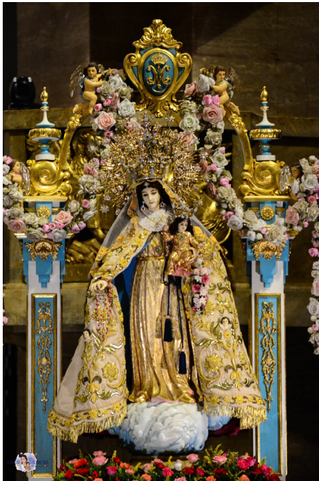
The image of the Nuestra Señora del Santísimo Rosario de la Universidad de Santo Tomás

The Santísimo Rosario Parish Church (UST Chapel) celebrated its 80 th Patronal Fiesta from September 3 to October 2, 2022. The month-long festivities culminated with a Misa Mayor presided over by the Archbishop of Manila, His Eminence José F. Cardinal Advincula, D.D.