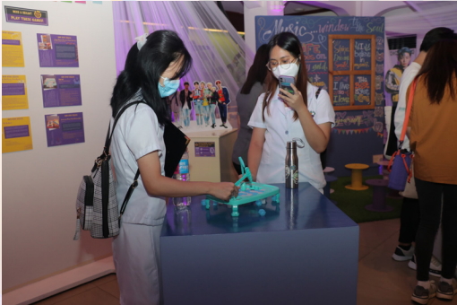
Students interact with the Penguin on Ice mini game.