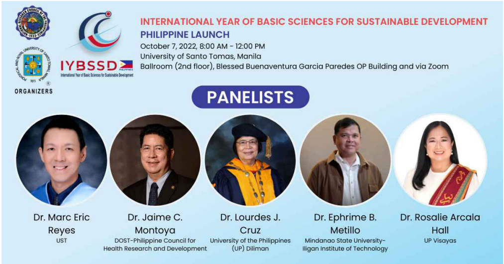
The roster of panelists

Strengthening foundational knowledge and highlighting the importance of basic sciences in our daily lives are vital now more than ever. To aid this endeavor, the University of Santo Tomas, through its College of Science, partnered with the Department of Science and Technology-National Research Council of the Philippines (DOST-NRCP) to celebrate the Philippine launch of the International Year of Basic Sciences & Sustainable Development (IYBSSD) on October 7, 2022, at the UST Paredes Building. IYBSSD emphasizes that the basic sciences provide means to meet crucial challenges of survival and learning, like universal access to food, energy, health coverage, and communication technologies, and can help limit or reduce climate change, depletion of natural resources, and extinction of living species. With such a scope, it is no wonder that the basic sciences are key to the United Nations' Agenda 2030 for Sustainable Development. DOST Secretary Hon. Dr. Renato U. Solidum, in his message, expressed that by constantly trying solutions generated from basic science research, alleviating the existing and anticipated problems in the Philippines is possible. He explained that, "We need to tackle health, energy, transport, water and environment, climate and disaster resilience, and these need to be supported by human resources development through scholarships until Ph.D., and training. We also need to focus on upgrading our laboratories not only at the national level, but most importantly,