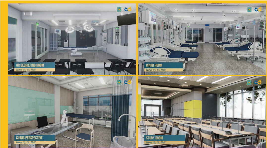
3D renders of the facilities inside the soon-to-rise Henry Sy, Sr. Hall

UST FMS CLOSSES 150TH ANNIVERSARY YEAR FROM PAGE 4