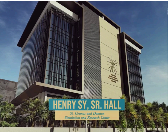
The 3D render of the Henry Sy, Sr. Hall, which will rise next to the Tan Yan Kee Student Center

At the end of the University of Santo Tomas Faculty of Medicine and Surgery’s (UST-FMS) 150 th anniversary celebration, its Anagyroi Foundation, Inc. (AFI) held “Go Further: Beyond 150 Years – A Capital Campaign” on October 3, 2022, at the Buenaventura Garcia Paredes O.P. Building lobby. The program recognized AFI’s current donors and pledgees, and served as an avenue to invite new potential donors. It also established the collaboration of AFI, University of Santo Tomas, and the alumni of the Faculty of Medicine and Surgery, the first and oldest school of medicine in the Philippines, which has produced over 40,000 doctors. “Go Further” was the official introduction to the public of the upcoming 1.2-billion PHP target that would address the Sts. Cosmas and Damian Simulation and Research