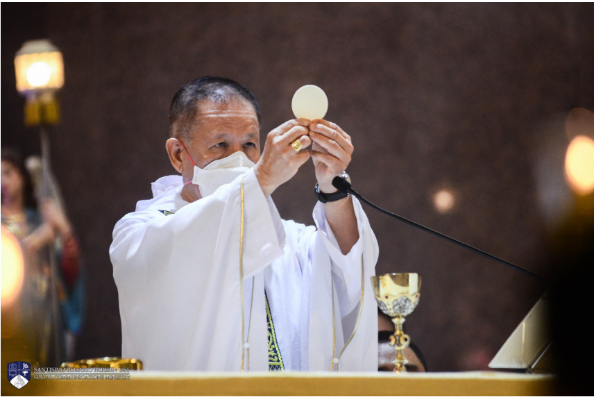
The Archbishop of Manila, His Eminence José F. Cardinal Advincula, D.D., presides over the Misa Mayor.

The roster of activities included a Mass Baptism on September 3 and a Mass Confirmation on September 18. Another highlight of the month-long festivities was the Dalaw Patrona , where the original image of the Nuestra Señora del Santísimo Rosario de la Universidad de Santo Tomás visited