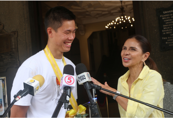
Obiena answers questions from the media.