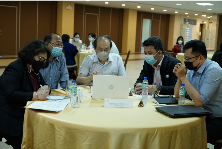
UST and NCKU officials are grouped together to discuss potential collaboration points.

UST, NCKU EXPLORE LINKAGE POINTS FROM PAGE 13