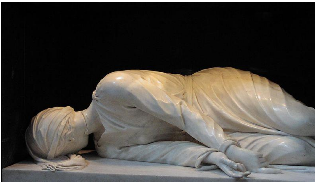
Figure 1: Stefano Maderno's Martyrdom of Saint Cecilia 3 , Church of St. Cecilia, Rome

As we commemorate the martyrdom of St. Cecilia, who “sang in her heart, only to God, saying: O Lord, I beseech You that my heart and body be cleansed so that I may not be confounded,” 2 let us also be gently reminded to offer to the Lord our gift of music.