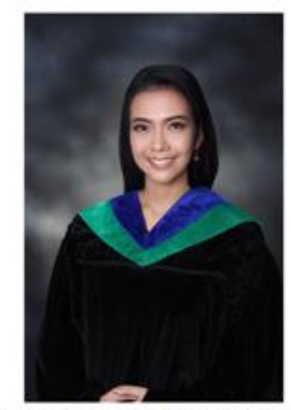
CELLPHONE CAMERA INDOOR SHOT - AFTER