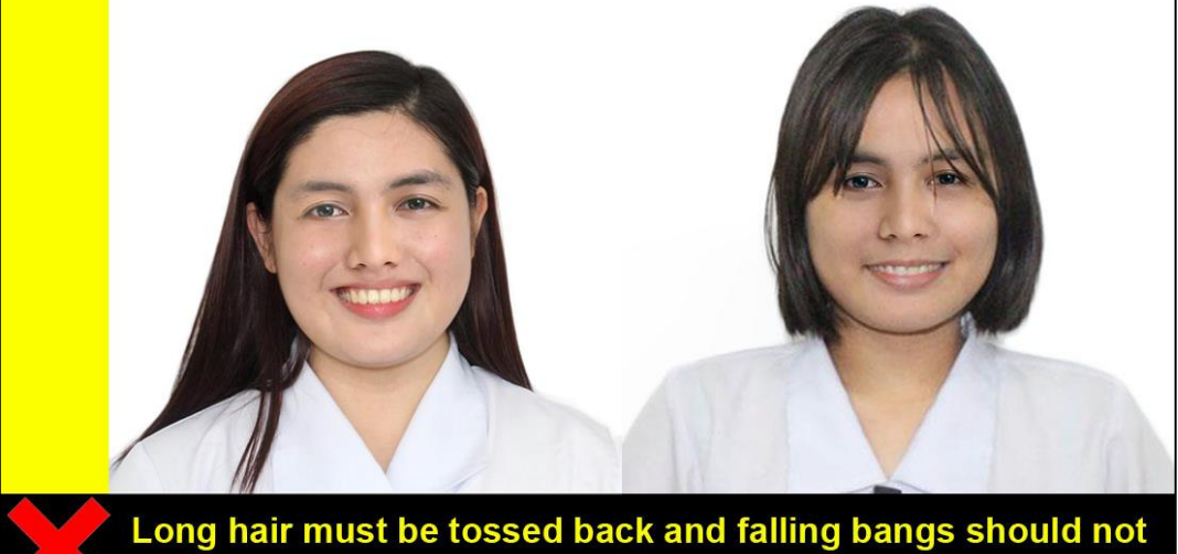
Long hair must be tossed back and falling bangs should not cover the eyes