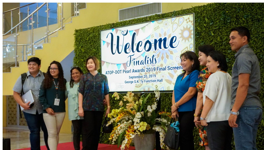
Participants from Samar province

Named Grand Winner for Best Tourism Research was Ormoc City, Leyte. The