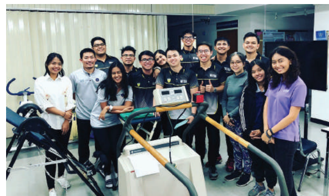
Sports Science interns share a photo with students from Mahidol University