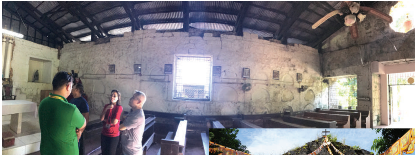
Assoc. Prof. Zerrudo (in grey shirt) and his team of conservation specialists conduct an ocular inspection and physical documentation of the structure.

Eastern Visayas appears to be more conscious of its built heritage post-Typhoon Yolanda. The hardest hit city in the region, Tacloban City, has seen some of its old houses transformed into cafés and hotels, while many historic towns in the region have been making efforts to restore their damaged heritage structures.