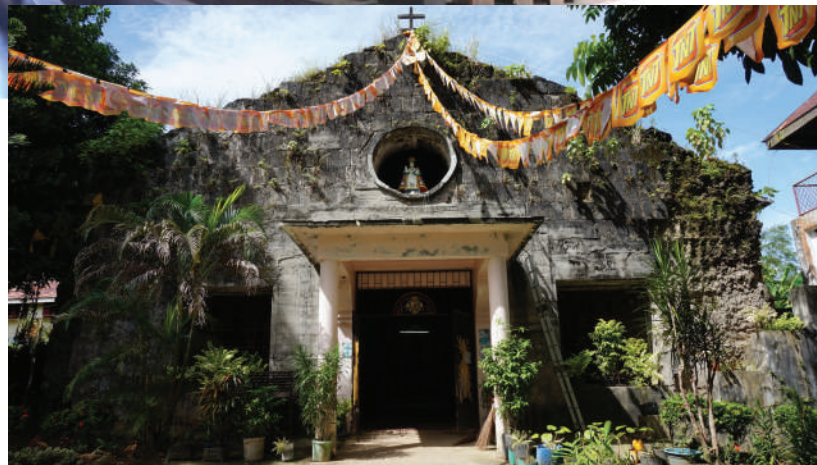
The facade of the Buscada Mortuary Chapel

research and documentation for the development of the CMP.