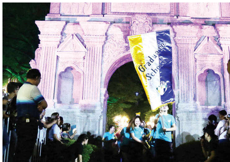
Students from the graduate school walk out of the Arch in the traditional send-off rite.