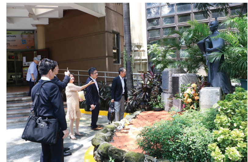
The delegation visits the Blessed Lord Takayama Sanctuary at the Thomas Aquinas Research Complex in UST.