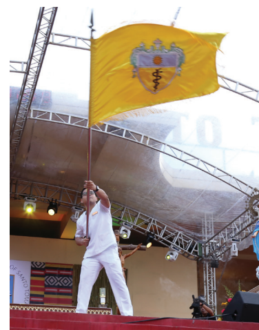
A student representative from the Faculty of Medicine and Surgery waves their college flag.

The much-awaited annual grand pyromusical lit up the University's skyline before the reccessional parade.