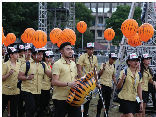
The pioneering batch of graduating students from the Institute of Physical Education and Athletics walk towards the UST Grandstand.