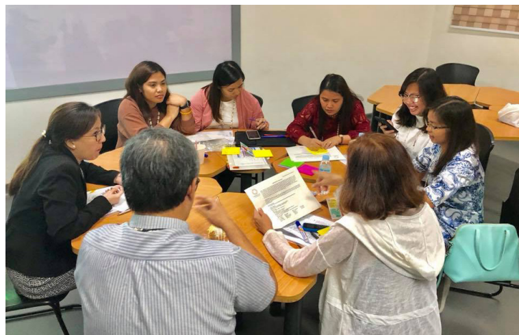
Participants discuss trends and issues during the workshop.