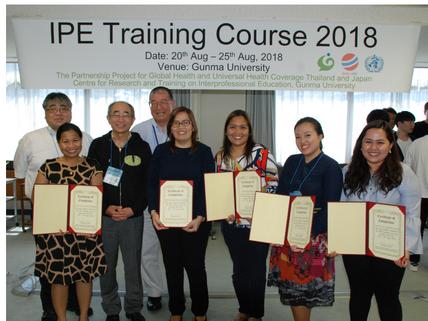
The UST CRS faculty members with Japanese colleagues at Gunma University.