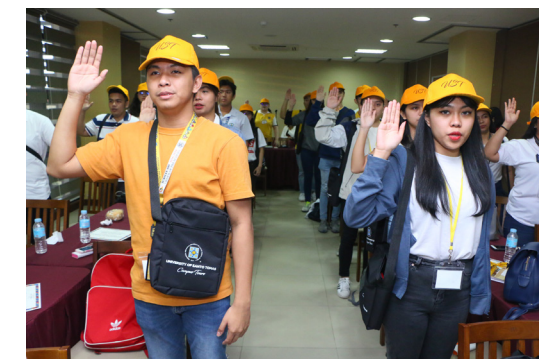
Participants take their oath to serve as tour guides and UST Student Ambassadors.