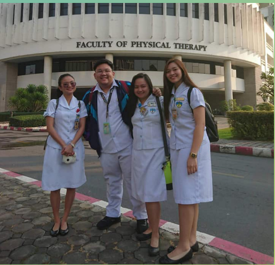
Fifth year PT students at Mahidol University Faculty of Physical Therapy

The participants consider the Thai GIE as a wonderful experience being exposed to the practice of Physical Therapy in Thailand. They also observed that the set-up in the two countries were different, since they had direct access for Physical Therapy. They also realized that Filipinos should be more proactive in terms of their profession and be able to do much more for the Filipino community in improving the profession.