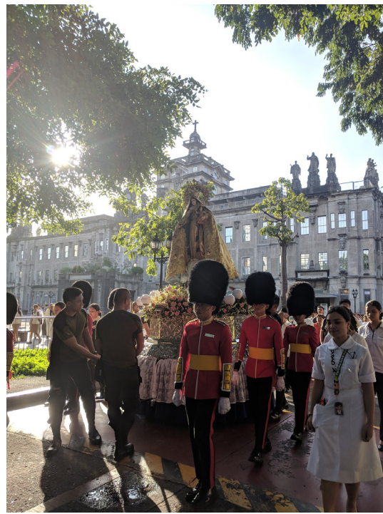
The procession from the Main Building to the Parish

customarily distributed to devotees and kept in their homes to protect the household.