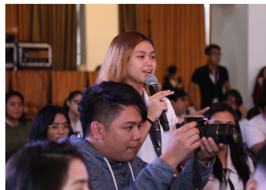
A student poses a question during the Slam Dunk Shooting session.

Three hundred seventy Communication Arts and Journalism students from the University of Santo Tomas (UST) Faculty of Arts and Letters participated in Documentary Caravan, a documentary creation training initiative by ABS-CBN, The Knowledge Channel, and the Philippine Association of Communication Educators (PACE). It was hosted by UST, in coordination with the Office of Public Affairs, on October 3, 2018, at the UST Paredes Building.