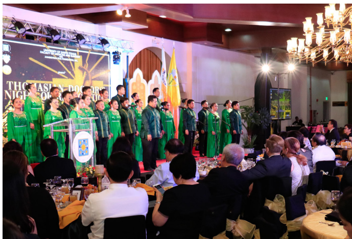
Two-time Luciano Pavarotti Choir of the World awardee, the UST Singers, perform for the awardees.

UST PAYS TRIBUTE TO OUTSTANDING MEDICAL ALUMNI FROM PAGE 6