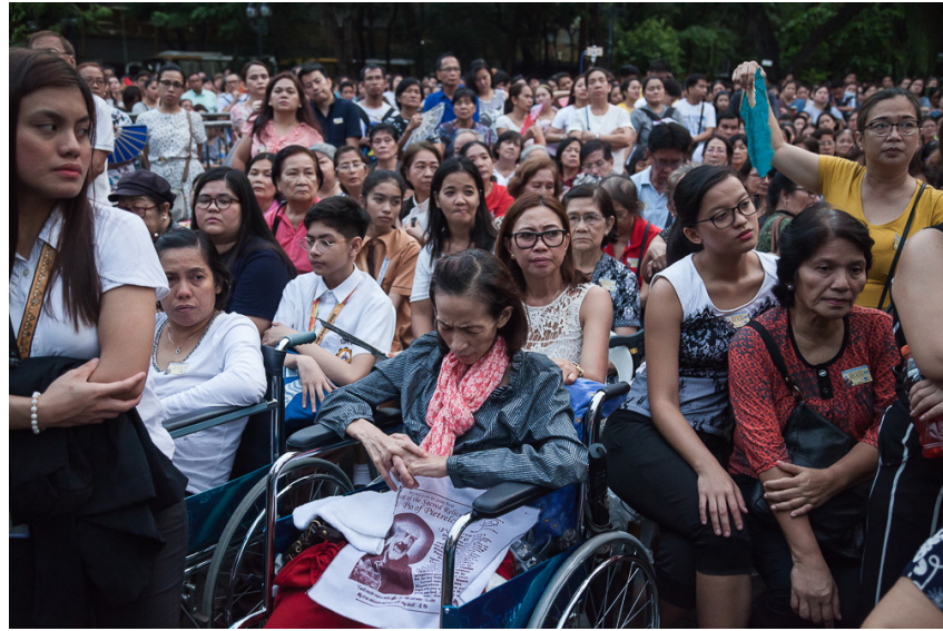
The devotees during the Eucharistic Celebration held at the UST Plaza Mayor

Saint Padre Pio of Pietrelcina, born Francesco Forgione, was an Italian priest known for his charity and piety. He took the name Pio when he joined the Order of Friars Minor Capuchin in honor of Pope Pius I, whose relic he often saw at his local Church. Despite his poor health, he became a priest in 1910, and in 1918, experienced the wounds of Christ appearing in his hands and feet. Upon manifestation of the stigmata , miracles began being attributed to him.