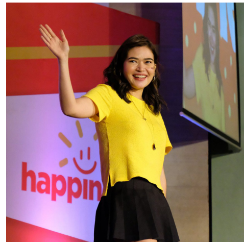
Ms. Bela Padilla