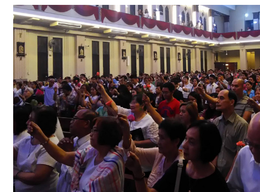
Devotees raise their roses for the blessing.

OUR LADY OF THE MOST HOLY ROSARY TO PAGE 12