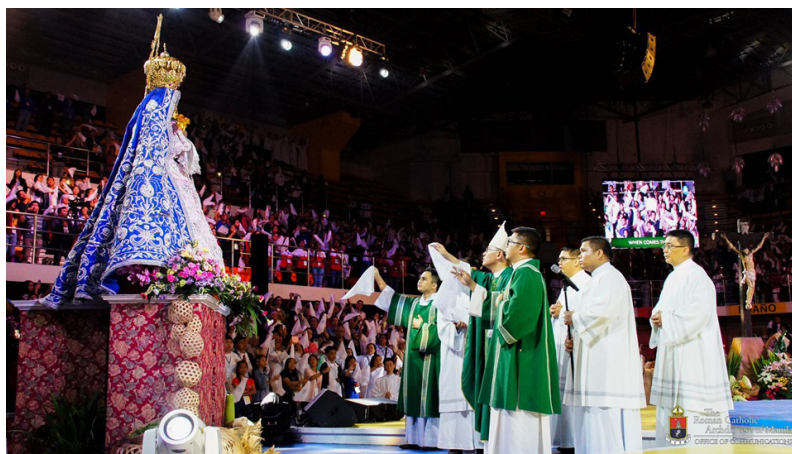
Cardinal Tagle and the participants of PCNEVI wave their white handkerchiefs in honor of the image of Our Lady of Piat.

In a final message at the closing of PCNE, Cardinal Tagle encouraged everyone to "Stay online with Jesus! Christ is alive!" and send this message to the community through social media posts and mobile text messages.