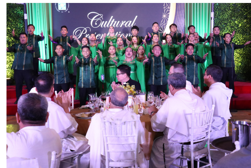
Two-time Choir of the World Luciano Pavarotti trophy award recipient The UST Singers performs during the testimonial dinner.