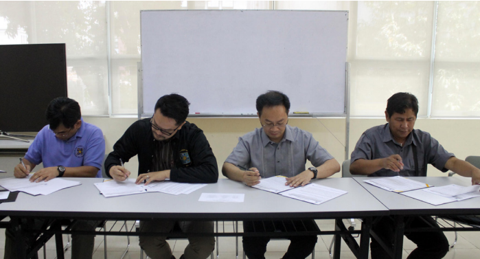
UST SIMBAHAYAN signs Memorandum of Understanding with the Diocese of Caloocan MUP