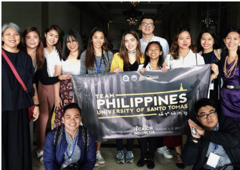
Thomasian delegates represent Team Philippines in 2017 d'CATCH Video Exchange Program