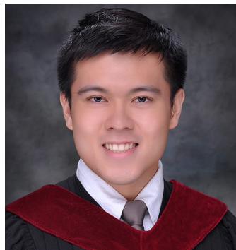
1st – 85.40% Marc Henrich Wee Eng Go

January 2018 UST passing rate: 85.71% National Passing Rate: 57.60%