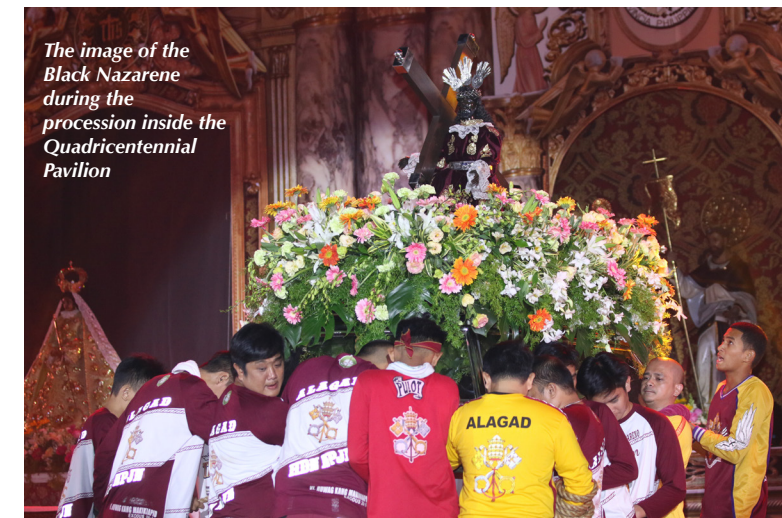
The image of the Black Nazarene during the procession inside the Quadracentennial Pavilion