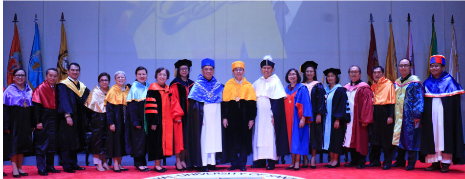
Tan Caktiong (tenth from left) with members of the Academic Senate of the University of Santo Tomas