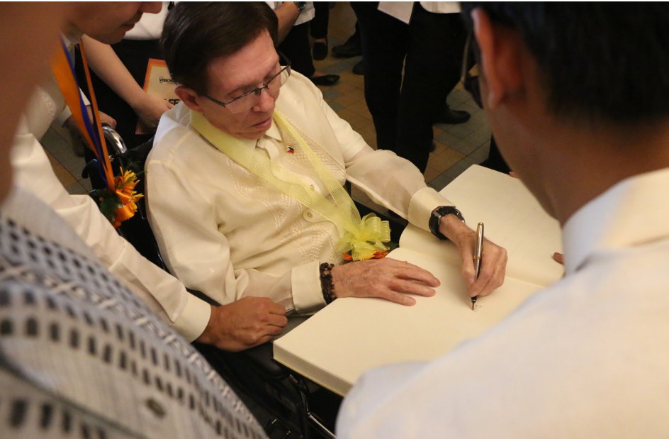
Ar. Francisco “Bobby” T. Mañosa