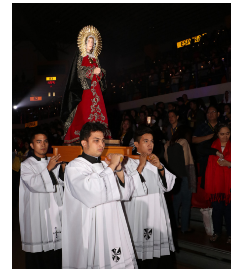
The image of Mater Dolorosa is carried to the stage by seminarians.