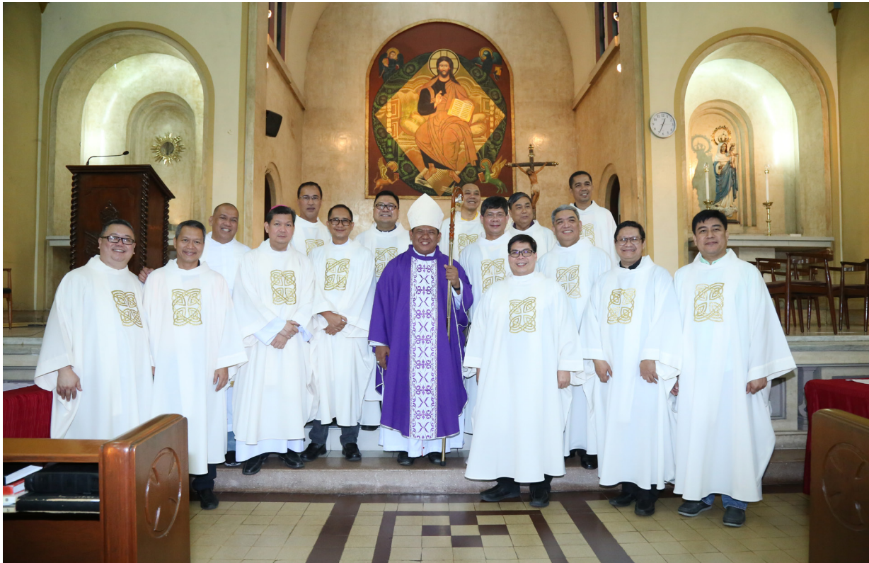
UST Alumni Priests Association (ALPA)