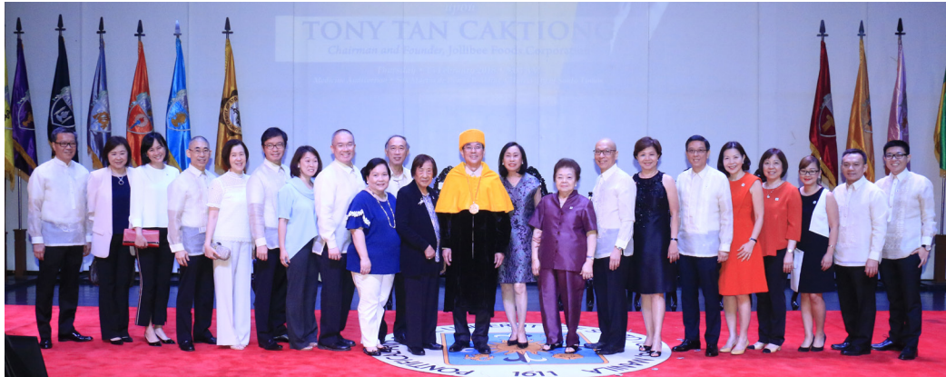
Tan Caktiong with his family

blessing of the Rector, the Chairman was presented to the audience as Dr. Tony Tan Caktiong, receiving a standing ovation before he delivered his message of acceptance.