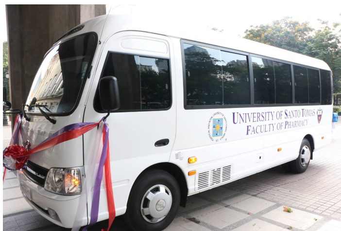
The county bus donated by Mercury Drug Corporation