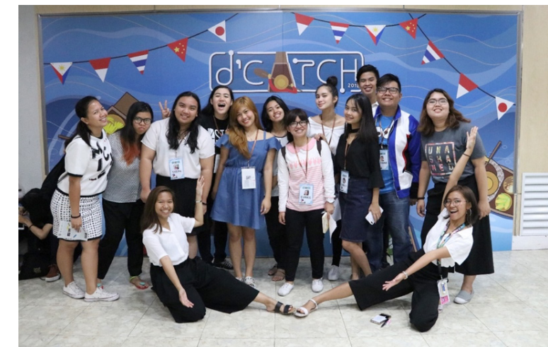
UST student participants at the d'CATCH Video Exchange Program

The workshop, held at Chulalongkorn University, was participated in by 68 student delegates and nine faculty members from Thailand, Indonesia, China, Philippines and Japan. The intercultural groups met for the first time and screened their videos followed by discussions about each country's video. The next days were then spent on conceptualizing and producing a collaborative video made up of each of the country's video. The event culminated with the Video Screening and symposium on January 25, 2018.