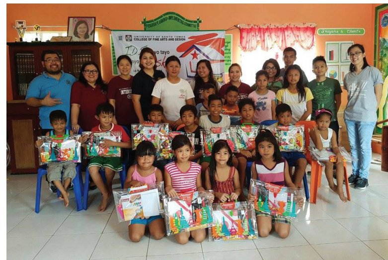
CFAD faculty members and the children who participated in the art camp

The Interior Design Department of the College of Fine Arts and Design: conducted the UST CFAD Interior Design Department Extension Project 1: Creative Enhancement on the Community ID. Sa inyo Tayo Ngayong Pasko sa Nagcarlan, Laguna. It was sponsored by Pacific Paint Philippines (BOYSEN). The participants were eight to ten year-olds and residents of Barangay Buenavista, Nagcarlan. Who were taught how to make greeting cards from the art kits given by Boysen Paints. Faculty members from the Interior Design Department together with UST Interior Design alumni, Simbahayan representatives, CFAD support staff and Barangay Buenavista local officials engaged in the pre-Christmas art camp held on November 27, 2016 which fueled the children’s festive spirit.