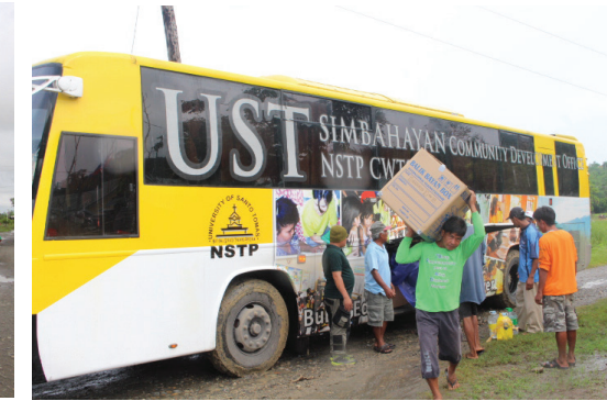
Members of the community beneficiaries from Nag-Uma, Sto. Niño, Cagayan, help in the transfer of the Tulong Tomasino relief boxes.