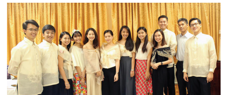
The delegates from the UST College of Science

The APIYN is the regional body of the Religions for Peace Global Interfaith Youth Network, a coalition which harnesses the energy and commitment of religious youth leaders around the world to advance its mission of multi-religious cooperation for peace. Religions for Peace is the world's largest multi-religious coalition, representing all religions and faith traditions.