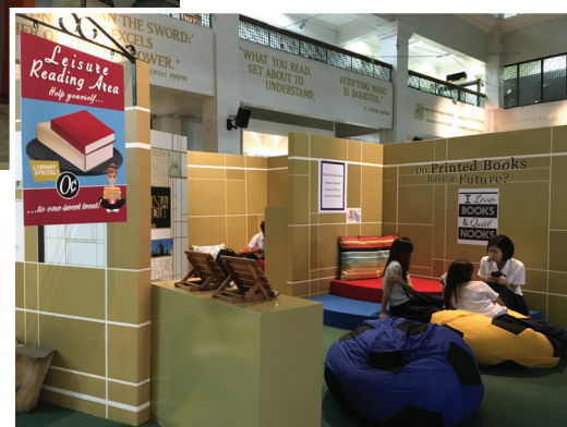
Leisure Reading Area