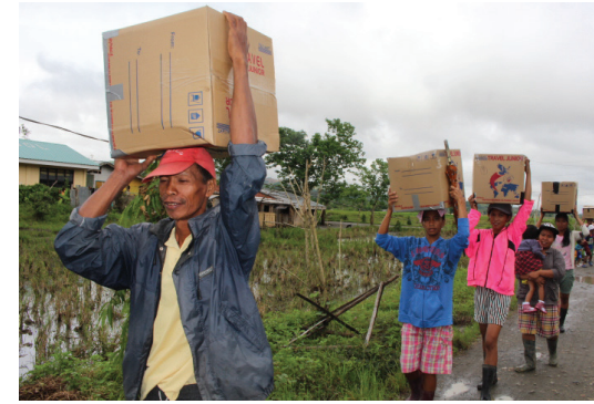
Beneficiaries from Nag-Uma, Sto. Niño, Cagayan, carry the Tulong Tomasino relief boxes they received.