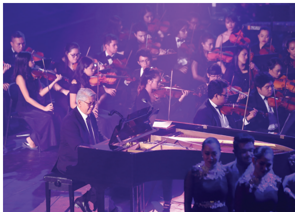
Maestro Ryan Cayabyab at the piano with the UST Symphony Orchestra