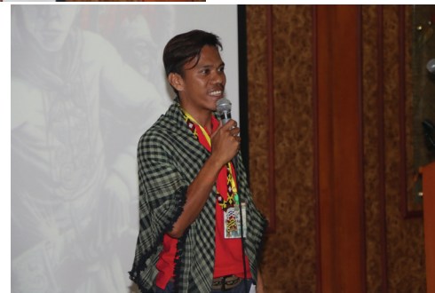
(upper and lower photos) Lumad IPs as guest speakers and performers during the 'Dialogue of Life: Continuing Journey with the Anawim (Rural People)' advocacy forum