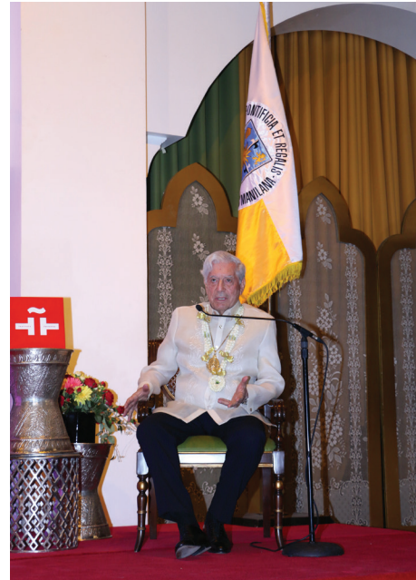
Nobel Laureate Mario Vargas Llosa delivers a lecture following his conferment of an Honorary Professor title