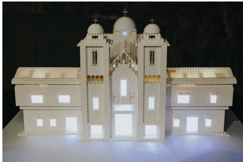
LEGO structure of the pre-war Lourdes Church and Convent

Five Architecture students from the University of Santo Tomas, Manila placed first and received the Most Innovative award in the recent iMake History Fortress Architecture Scale Model Competition as announced during the awarding ceremony that took place at the iMake History Fortress at Baluarte de Santa Barbara, Fort Santiago on March 19, 2018.