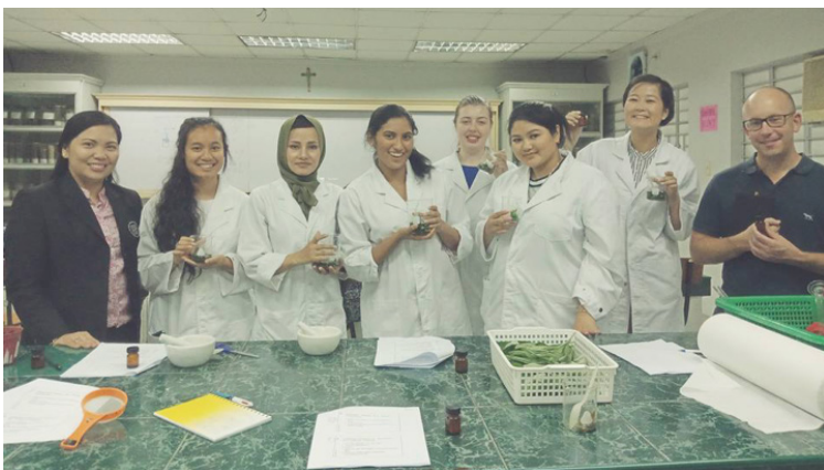
Lecture and workshop on herbal medicines, Philippine medicinal plant and community herbal preparations