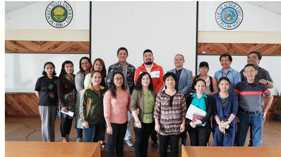
Members of the teaching panel during the outreach lecture

The UST for Creative Writing and Literary Studies (UST CCWLS) conducted the 2018 edition of its National Writers’ Workshop held from March 18 to 25, 2018 at the Ridgewood Residence Hotel, Baguio City.