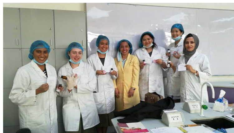
Pharmaceutical Dosage Forms lecture and workshop