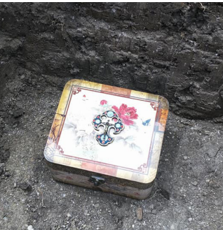
Blessed Sacraments are placed in a box and buried at the site of the General Santos City campus