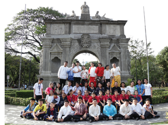
Students of the Samroiody Wittayakham School of Thailand with the students of UST Education High School

Meanwhile, the Junior High School Students from the Special English Program of the Samroiody Wittayakham School of Thailand were accompanied