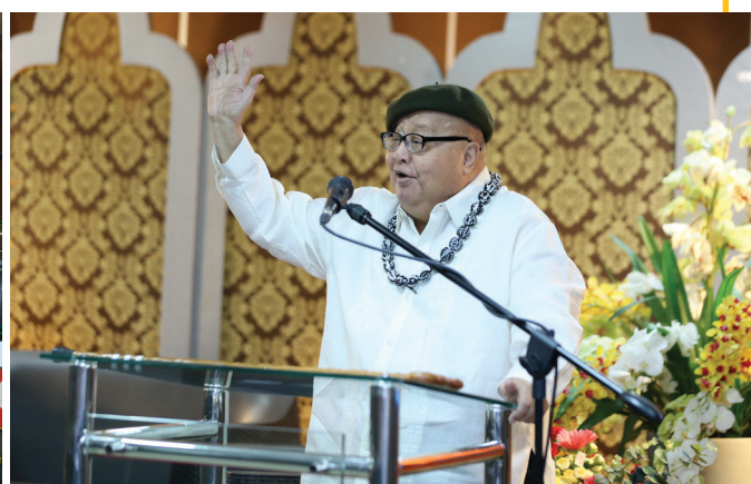
National Artist for Literature, Mr. F. Sionil José delivers his keynote address at the Iowa International Conference.