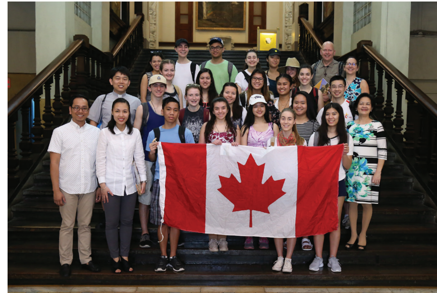
The Office of Public Affairs with the students of Saint Thomas Aquinas High School Canada

On two separate occasions, students from a high school in Canada which bears the same name as this Pontifical and Royal University, and students from a high school in Thailand visited the University of Santo Tomas Education High School.