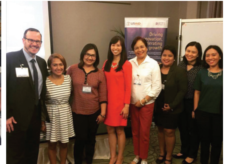
UST consultants and representatives at the career center conference.

Career center consultants from the United States visited the University of Santo Tomas Counseling and Career Center (CCC) from March 29 to 31, 2017 to continue to provide technical assistance in developing a model career development center in the Philippines. This visit, in line with the grant awarded to UST by the United States Agency for International Development – Science, Technology, Research and Innovation (USAID STRIDE), was a follow-up to their first and second visits held in September 2014 and November 2015, respectively.