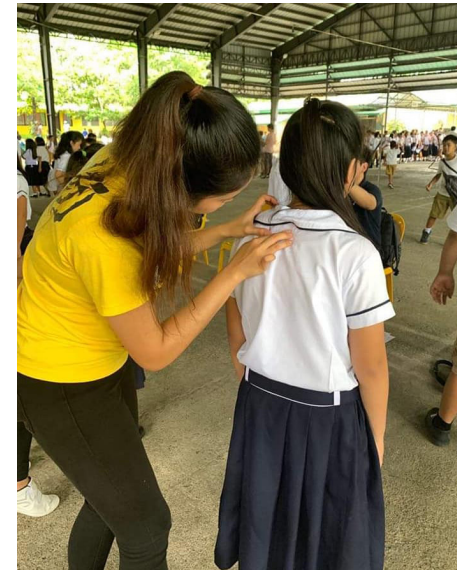
A Thomasian volunteer examines a student from one of the partner schools in Talavera, Nueva Ecija

A total of 20 volunteer Thomasian Physical Therapists composed of College of Rehabilitation Sciences (CRS) administrators, faculty members and alumni visited several schools in the municipality of Talavera, Nueva Ecija to screen 1,415 Grade 5 and Grade 6 students from Talavera Central School, Talavera North Elementary School, Talavera South Elementary School and Schola Christi, Inc.