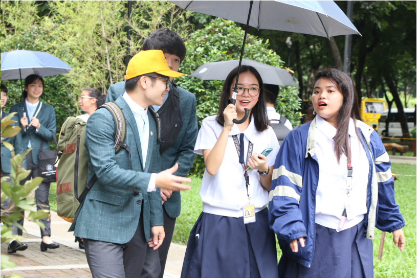
Taiwan Youth Ambassadors interact with students from the UST Faculty of Arts and Letters (left photo) and with students from UST Faculty of Medicine and Surgery (right photo).