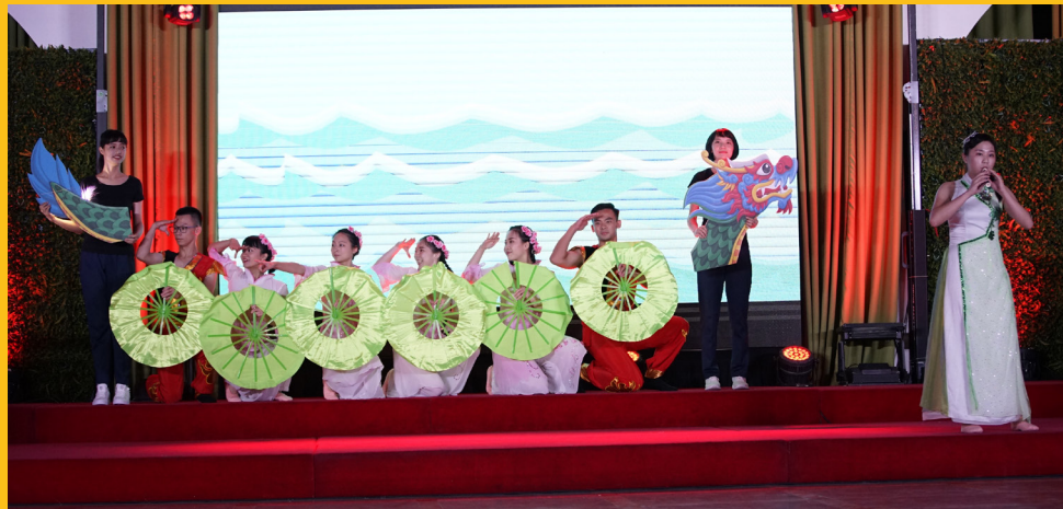
The Dragon Boat Festival is presented.