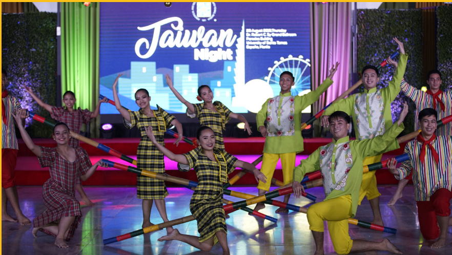
The UST Salinggawi Dance Troupe presents the “Tinikling.”