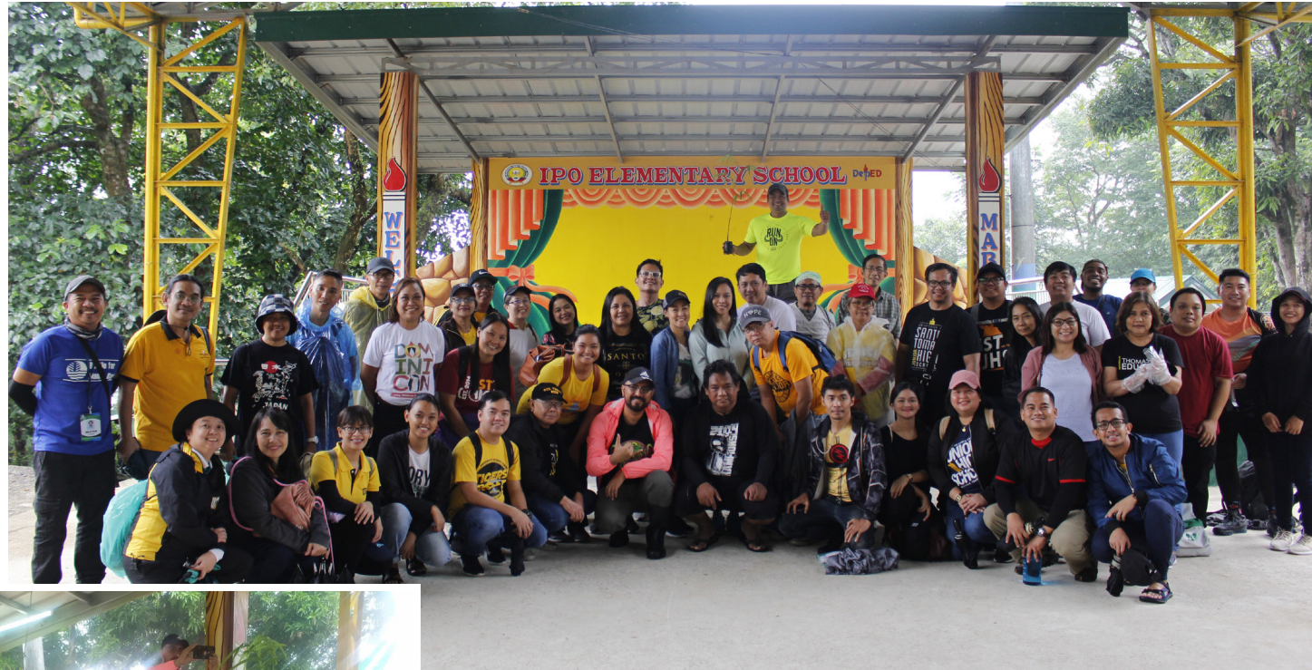
Thomasian administrators, faculty, support staff, alumni, and DENR staff during the Community Service Day

A total of 50 volunteers participated in the biannual Community Service Day organized by the UST SIMBAHAYAN Community Development Office (SIMBAHAYAN) in coordination with the Department of Environment and Natural Resources Central Office (DENR) held on August 24, 2019. Planted at the Ipo Watershed in Brgy. San Mateo, Norzagaray, Bulacan, were 100 seedlings of narra and coffee in the one-hectare area prepared by the Bantay Gubat and staff of DENR.