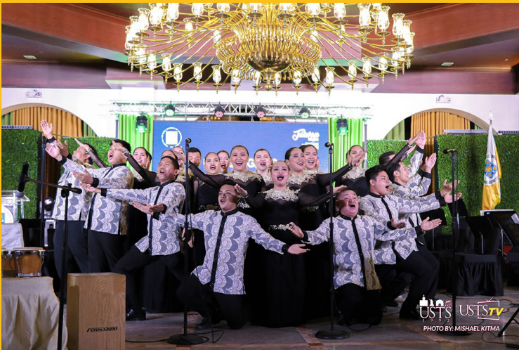
The UST Singers performs “Come Alive.”