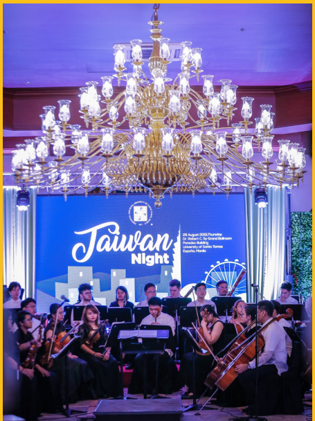
The UST Symphony Orchestra