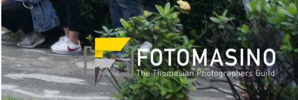
UST-AMV College of Accountancy freshmen are about to enter the Arch.