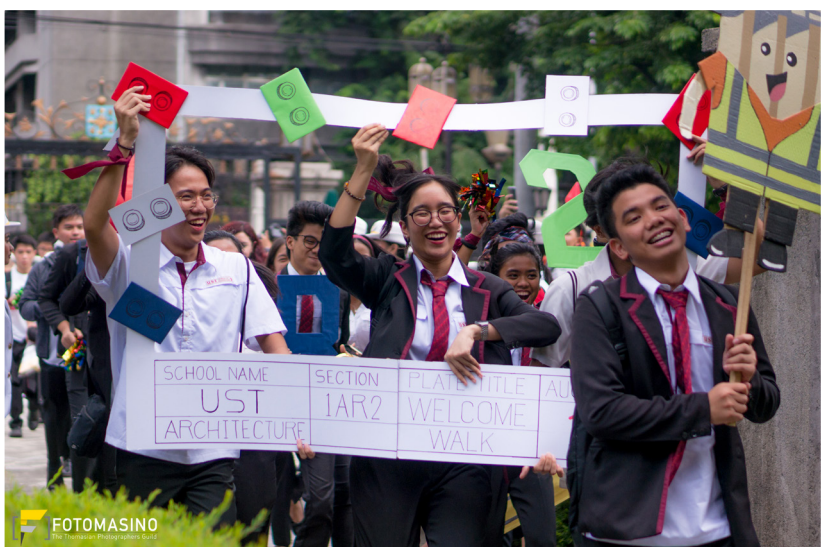
Freshmen from the College of Architecture walk through the Arch of the Centuries with self-made props.