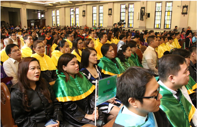
Faculty members listen to the Discurso de Apertura .