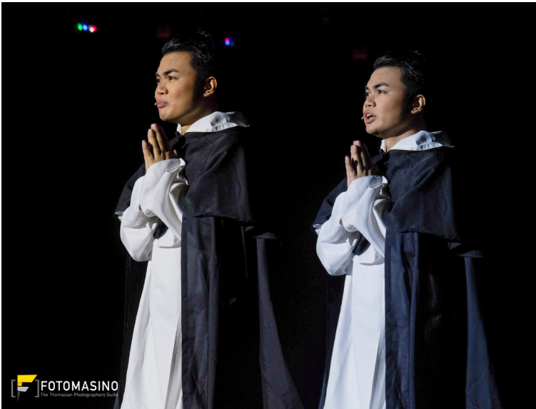
Mediartix members present a short play on the life of St. Thomas Aquinas.