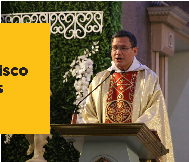
Master of the Order of Preachers and University of Santo Tomas Chancellor Very Rev. Fr. Gerard Francisco P. Timoner III, O.P., delivers the homily.