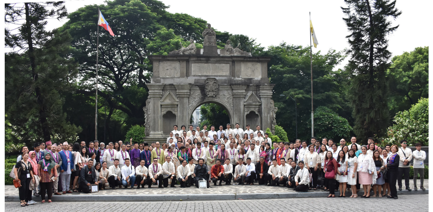
Delegates of the first Asian Architects in the Academe Assembly at the Arch of the Centuries