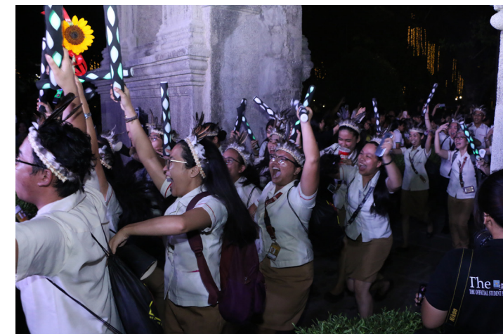
Graduating students from the University of Santo Tomas-AMV College of Accountancy cheer as they leave through the Arch of the Centuries.