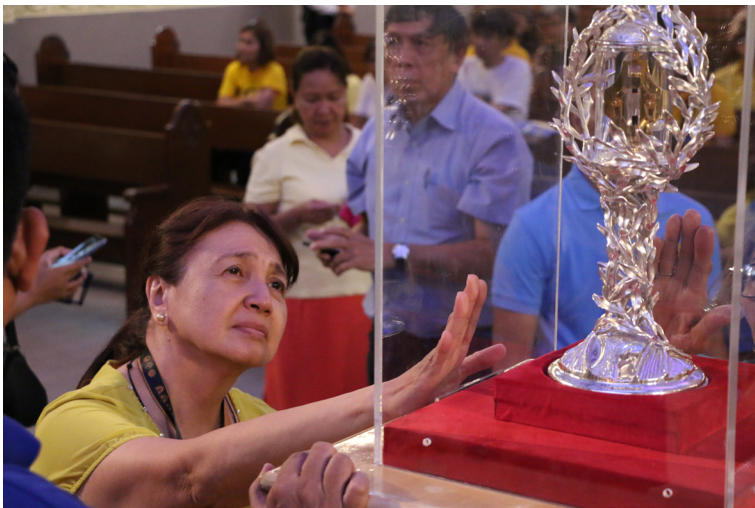
A devotee of the Pope prays to the blood relic at the Santísimo Rosario Parish.

Following the Mass, a veneration period that was open to the public proceeded at the Main Building, before the blood relic was brought back to the Santísimo Rosario Parish where it was venerated until the morning of the following day.