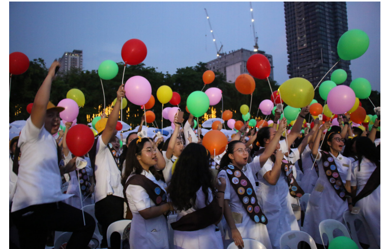
Graduating students from the University of Santo Tomas College of Nursing cheer with their balloons.