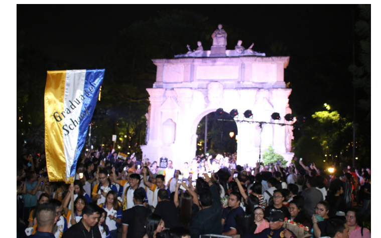
Graduating students from the UST Graduate School exit the Arch of the Centuries as a symbolic conclusion to their student life.