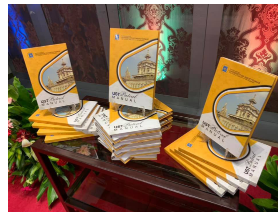
The UST Protocol Manual

The special event was attended by University administrative and academic officials. Copies of the book, along with a package of postcard-sized checklists for preparing visits and events were given as a token.