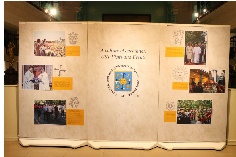
The exhibition shows highlights of UST visits and events in line with the University's identity as captured in the elements of the Seal.

Along with a special video introducing the Manual, produced by the UST Communications Bureau for the event, an exhibition featuring special visits and events held in the University was mounted. Titled "A Culture of Encounter," it highlighted activities that meaningfully correspond to the University's identity, as encapsulated within the six elements found in the Seal of the University.