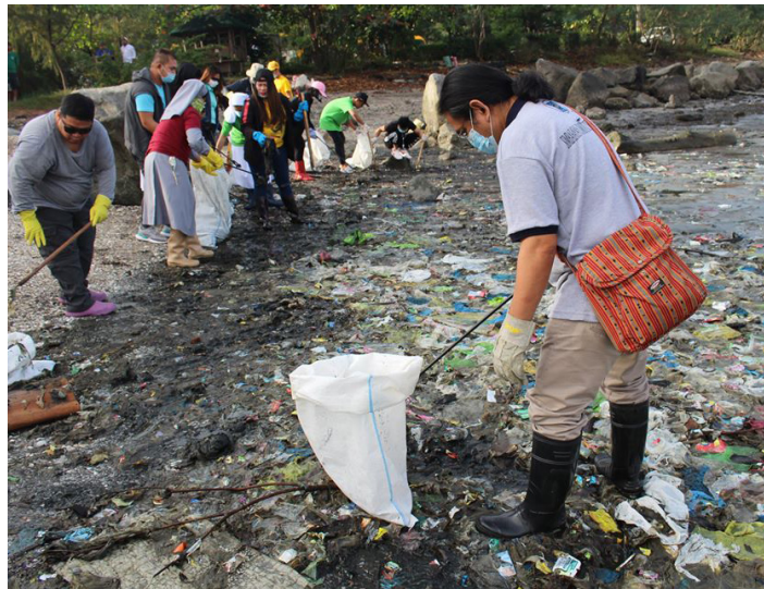
Thomasian volunteers clean the shoreline.

To take a proactive response to the call of Pope Francis's Laudato Si , University of Santo Tomas administrators, faculty, support staff, and alumni were invited to participate in this yearly care for environment activity. The UST SIMBAHAYAN Community Development Office annually conducts its Community Service Day every January, in commemoration of the feast day of St. Thomas Aquinas, the University's patron saint, which falls on January 28.