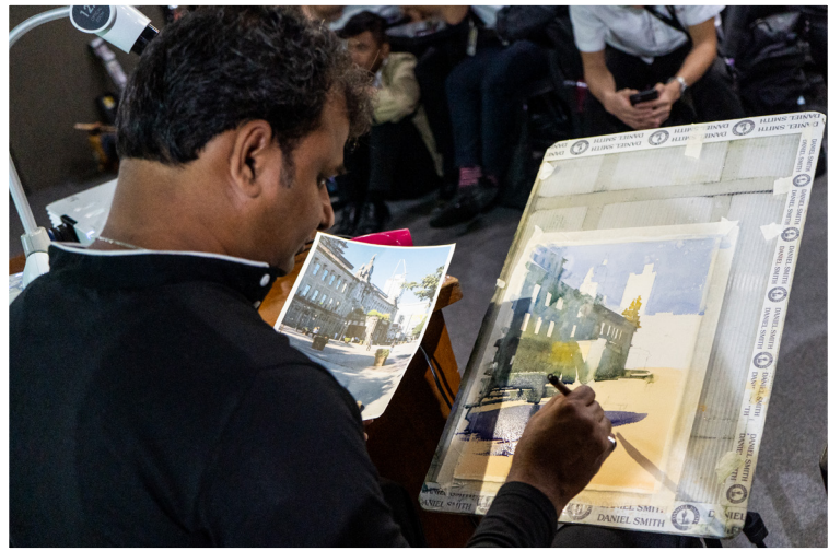
Prafull Bhimraj Sawant held an on-the-spot demonstration with the students with the UST Main Building as his subject

Internationally acclaimed watercolor artist Prafull Bhimraj Sawant held a watercolor demonstration and workshop for freshman students of the College of Architecture and the College of Fine Arts and Design held at the Audio-Visual Room of the Beato Angelico Building on January 23, 2020.