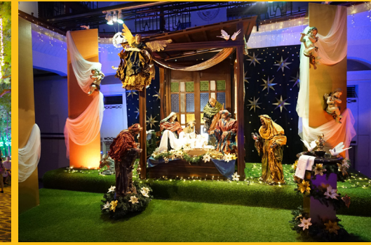
A Nativity scene features prominently at the Main Gallery of the UST Museum