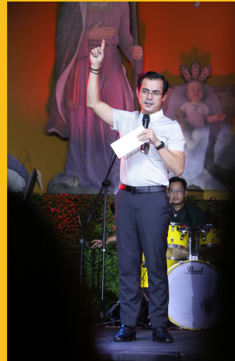
Manila City Mayor Francisco “Isko Moreno” Domagoso declares the lighting ceremony open at UST.