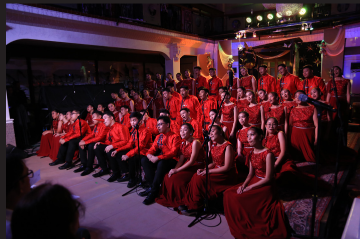
The UST Junior High School Glee Club