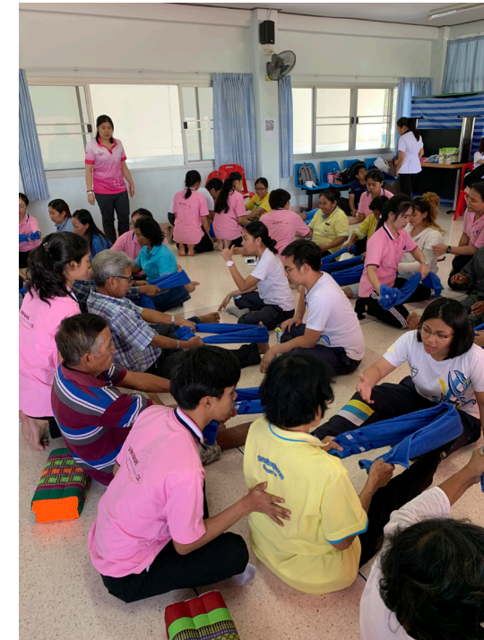
Physical Therapy Interns (in white uniform) participate in the St. Louis College Community Based Rehabilitation

The highlights of their experience included participation in lecture-workshops on kinesiotaping, Schroth exercise for scoliosis, lymphatic drainage therapy, and Thai massage; involvement in community-based rehabilitation for two weekends in Suphun Buri province; clinical practice in the Central Chest Institute of Thailand, Rajavithi Hospital, Bamrasnaradura Infectious Disease Institute; manipulation of high frequency therapy machines at the SLC PT Clinic. They felt that they were very blessed to be participants in welcoming