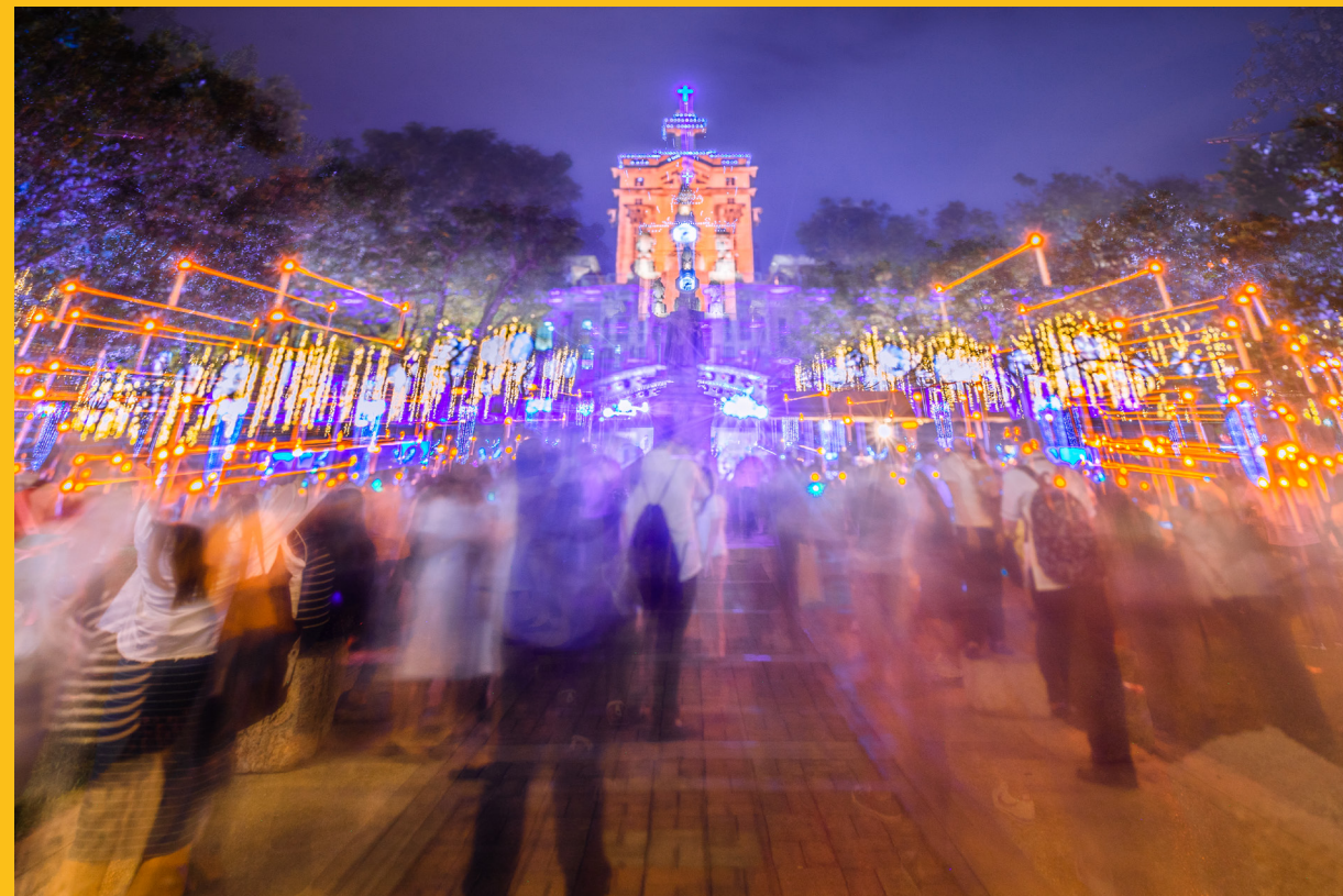
The Cross atop the Tower of the University of Santo Tomas Main Building shines like a beacon above all other lights