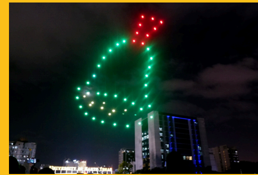
A Christmas bell is formed by drones above the UST Open Field