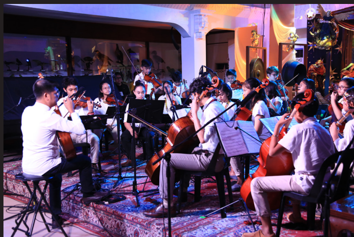
The Kolisko Waldorf School Haraya String Ensemble