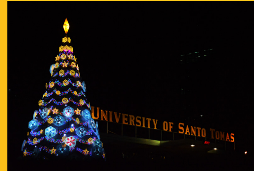
The 70-foot tall Christmas tree near the University of Santo Tomas Grand Stand