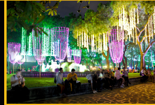
The trees of the UST Benavides Garden are decked out in festive lights