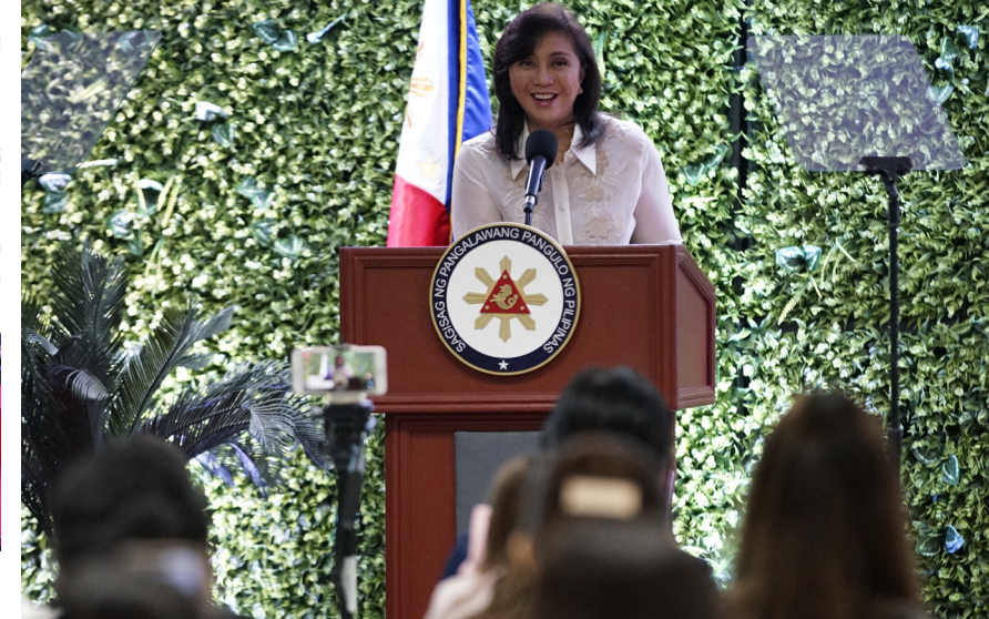
Vice President of the Philippines Her Excellency Maria Leonor "Leni" G. Robredo delivers a speech.