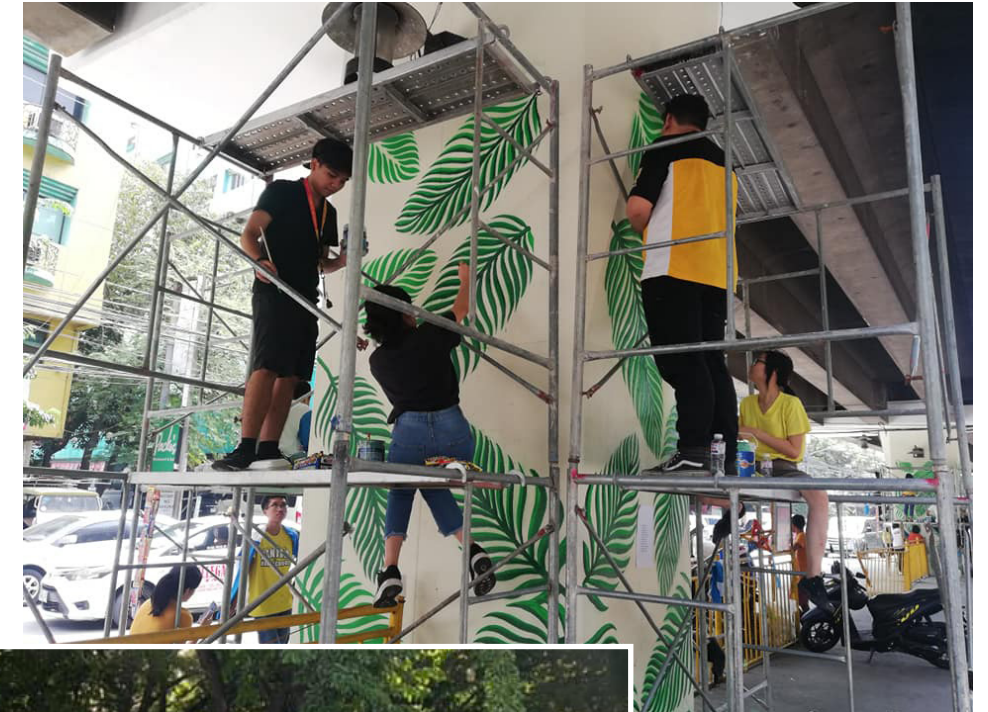
CFAD students paint the support beams of the Light Rail Transit.

The project was initiated by the Manila Tourism and Cultural Affairs Bureau (MTCAB), with UST’s participation coordinated through the Office of Public Affairs and College of Fine Arts and Design.