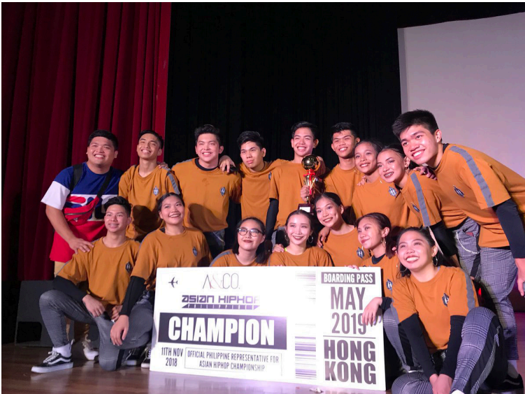
The 15 students that comprise 'Galvanize'

Established in 2016, 'Galvanize' also bagged championships in the UAAP Season 80 Juniors Street Dance Competition and the Novice Division of the 2016 and 2017 Step Up Hip Hop Competition.