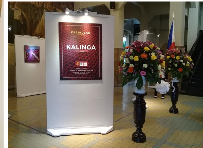
The "Kalinga" (Nurture) exhibit

The University of Santo Tomas (UST) Museum, together with the National Commission for Culture and Arts (NCCA) and Kababaihan sa Sining at Bagong Silbol na Kamalayan (KASIBULAN), mounted the "Kalinga" (Nurture) exhibition at the UST Main Building Lobby on October 27, 2018. This event coincided with the celebration of the National Indigenous People's Month in October.