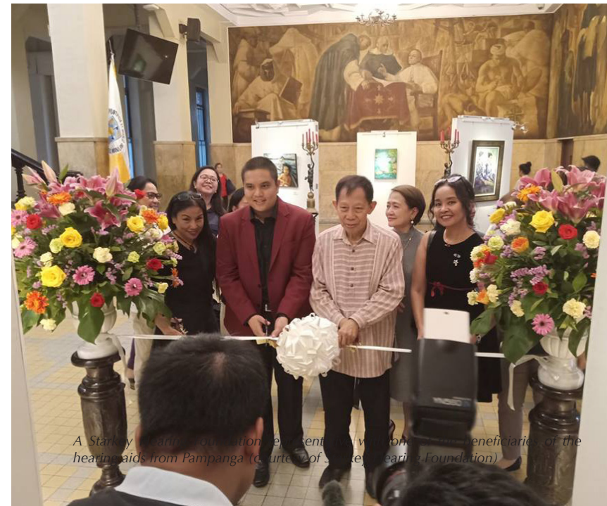
A Starkey Foundation exhibition is presented in which the beneficiaries of the health aids from Pampanga