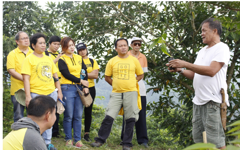
Thomasian administrators, faculty, support staff, alumni, and guests listen to the orientation on how to plant seedlings properly.