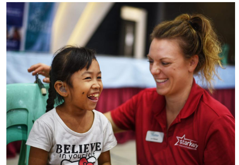
A Starkey Hearing Foundation representative with one of the beneficiaries of the hearing aids from Pampanga