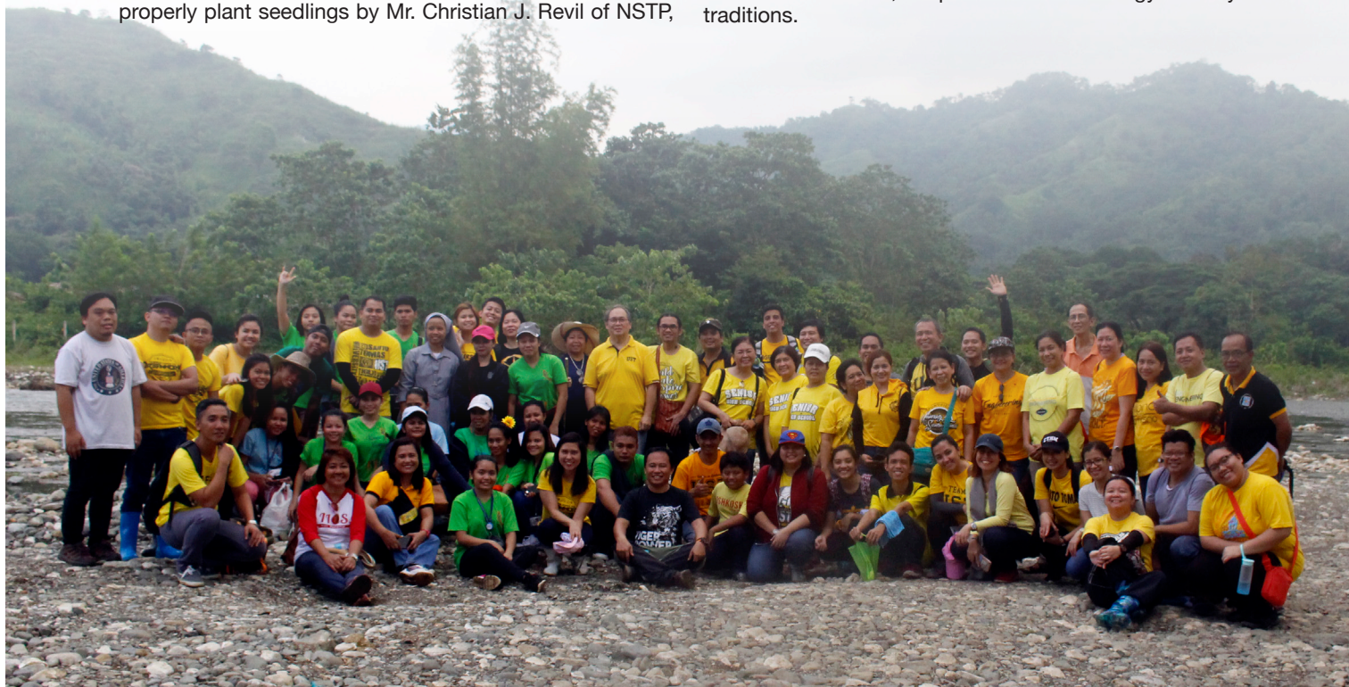
Thomasian administrators, faculty, support staff, alumni, and guests at Barangay Sto. Niño, Tanay, Rizal.

The Season of Creation is celebrated annually from September 1 to October 4 by Christians around the world through activities that vary from prayer services to clean-up advocacy actions. September 1 is the Day of Prayer for Creation while October 4 is the feast day of St. Francis of Assisi, the patron saint of ecology in many traditions.