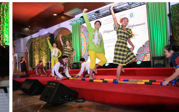
The Salinggawi Dance Troupe performs the "Tinikling", a traditional Filipino folk dance.