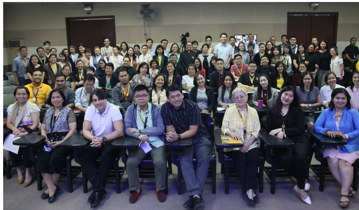
LinkEd 2.0 participants

The first LinkEd was held last year on January 18 and 19, 2018 at the UST Paredes Building. It was called "LinkEd: The first social media in education summit."