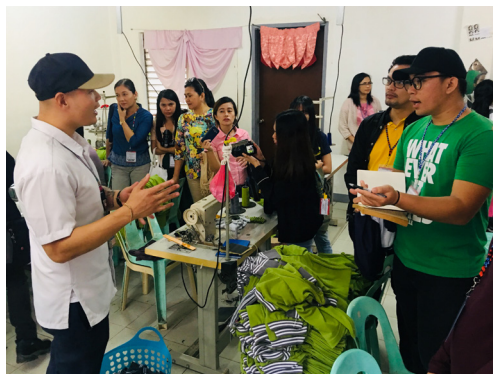
The participants during the community engagement activity at a local rehabilitation center

higher learning, and its activities include the promotion and enhancement of the Christian identity of its member institutions as leading centers of teaching, research and service. Its annual conferences, particularly those held from 2013 up to the present, have themes that are anchored on papal encyclicals and other similar documents.