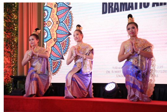
Dancers from Ang Thong College of Dramatic Arts present "Natnaree Sri Ayothaya," a tribute to the beauty of Thai women and delicate style of Thai dances.